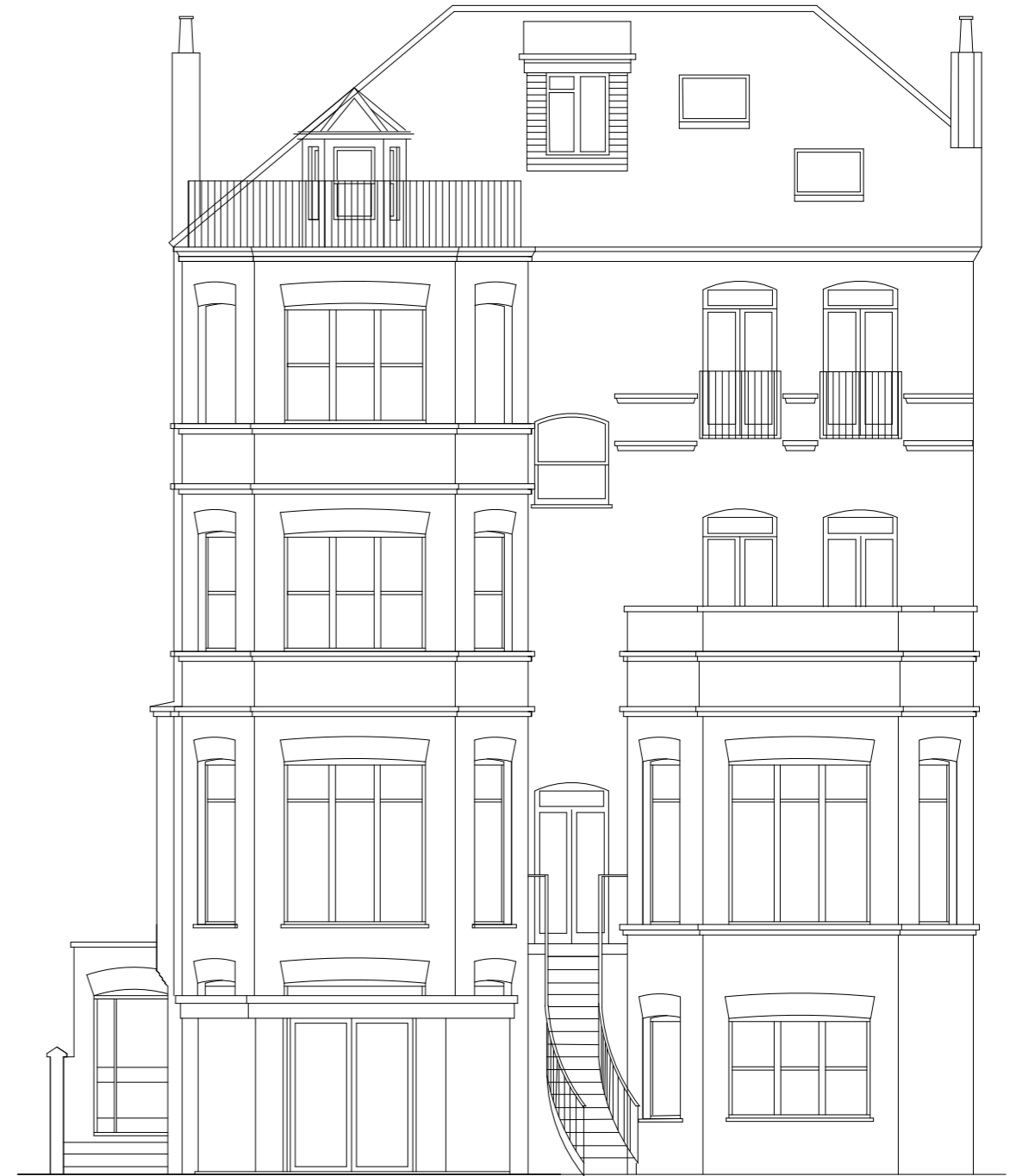
1 Existing Elevations Scale: 1:100