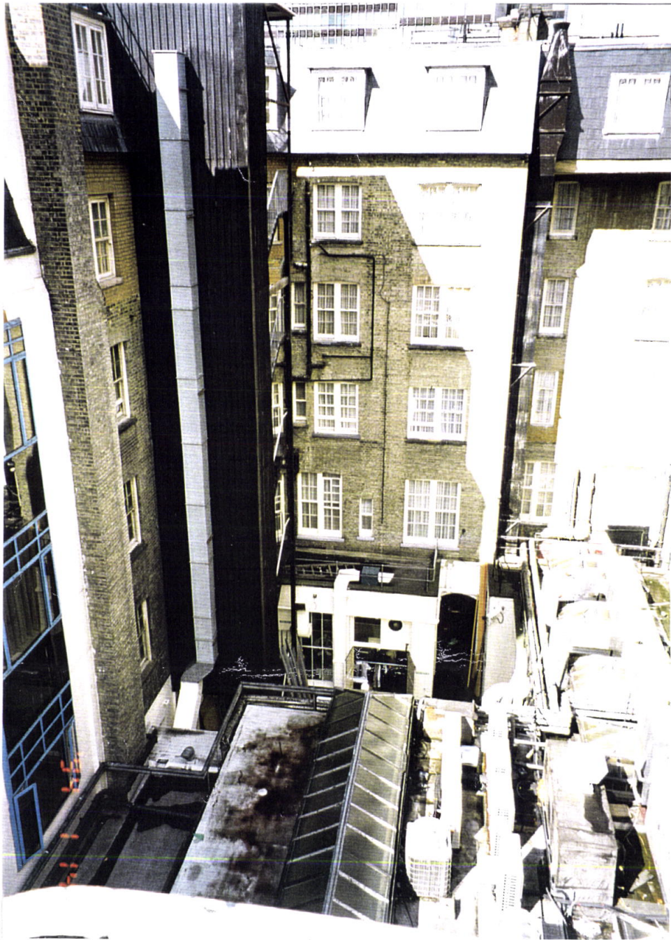
General View of the yard to be infilled showing surrounding buildings taken from fifth floor level. 8th September, 1998.