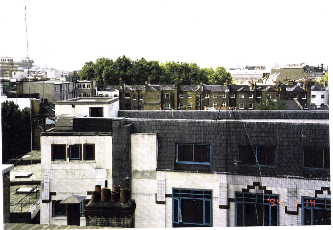
View of the fifth floor flat roof at the rear of the hotel looking South West taken from the room over the front of the hotel.