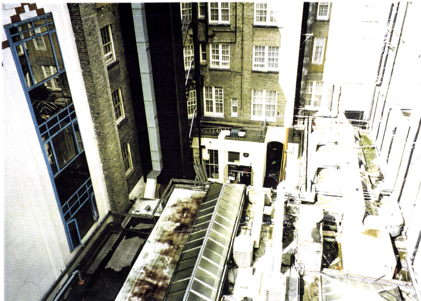
Close up view of the yard to be infilled taken from fifth floor level. 8th September 1998.