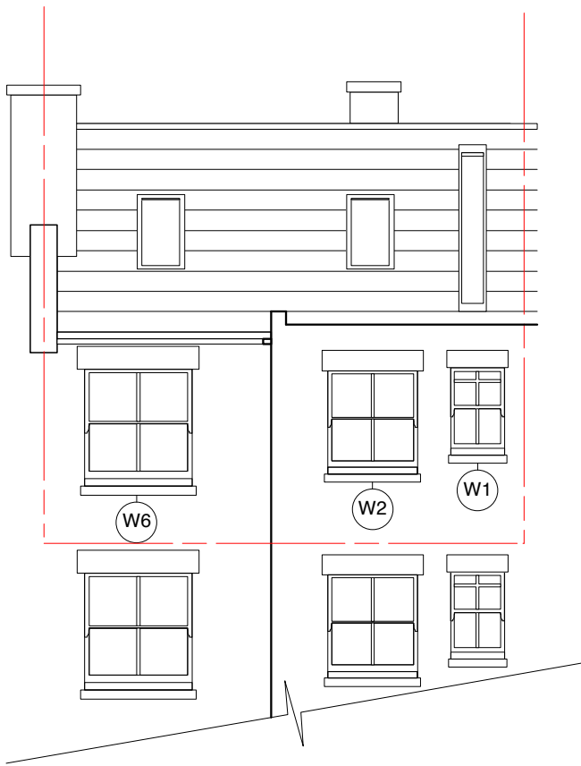
Part Rear Elevation as proposed scale 1:100