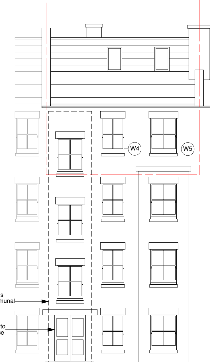
Front Elevation as existing scale 1:100

Chained line indicates width of internal communal stair access