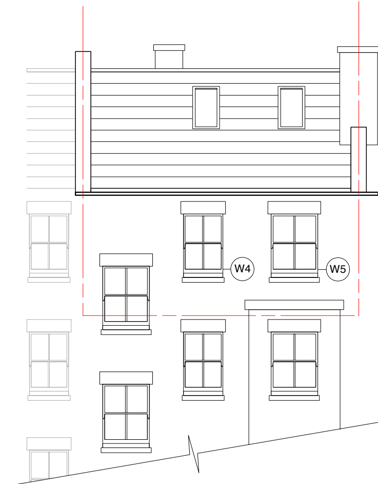
Part Front Elevation as proposed scale 1:100