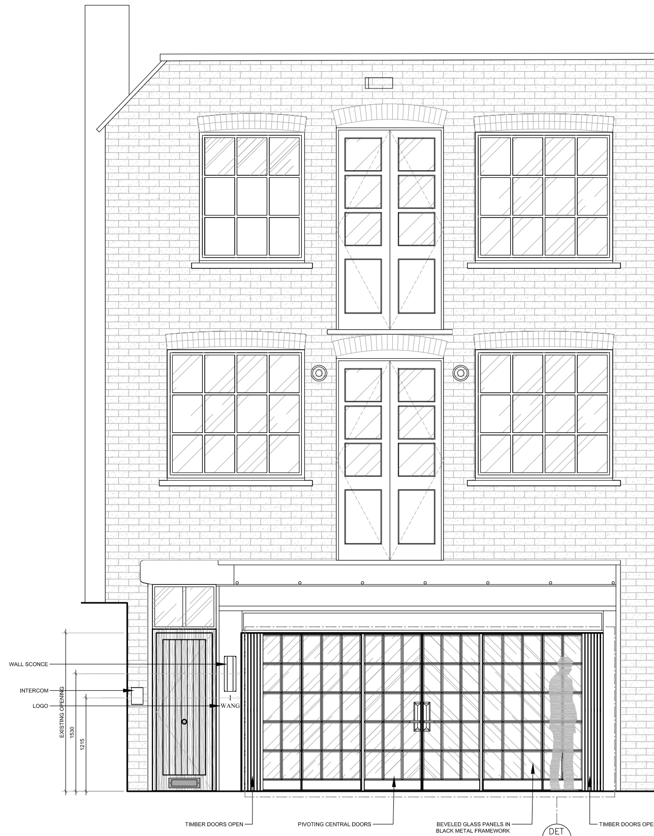
B FACADE - PROPOSED ELEVATION 1:50 @A3