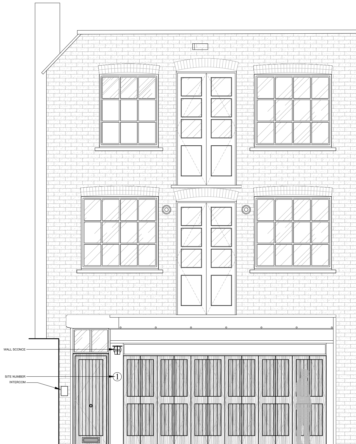
A FACADE - EXISTING ELEVATION 1:50 @A3

ALL IDEAS, DESIGNS AND PLANS INDICATED OR REPRESENTED BY THESE DRAWINGS ARE OWNED BY AND ARE THE PROPERTY OF JOYCE WANG LTD. AND WERE CREATED AND DEVELOPED FOR USE IN CONNECTION WITH THE SPECIFIED PROJECT. NONE OF SUCH IDEAS, DESIGNS OR PLANS SHALL BE USED FOR ANY PURPOSE WHATSOEVER WITHOUT WRITTEN PERMISSION OF JOYCE WANG LTD. DO NOT SCALE FROM DRAWINGS. CONTRACTORS HAVE THE RESPONSIBILITY TO DEVELOP ALL DETAILS FURTHER WHEN REQUIRED. DO NOT SCALE FROM THIS DRAWING.