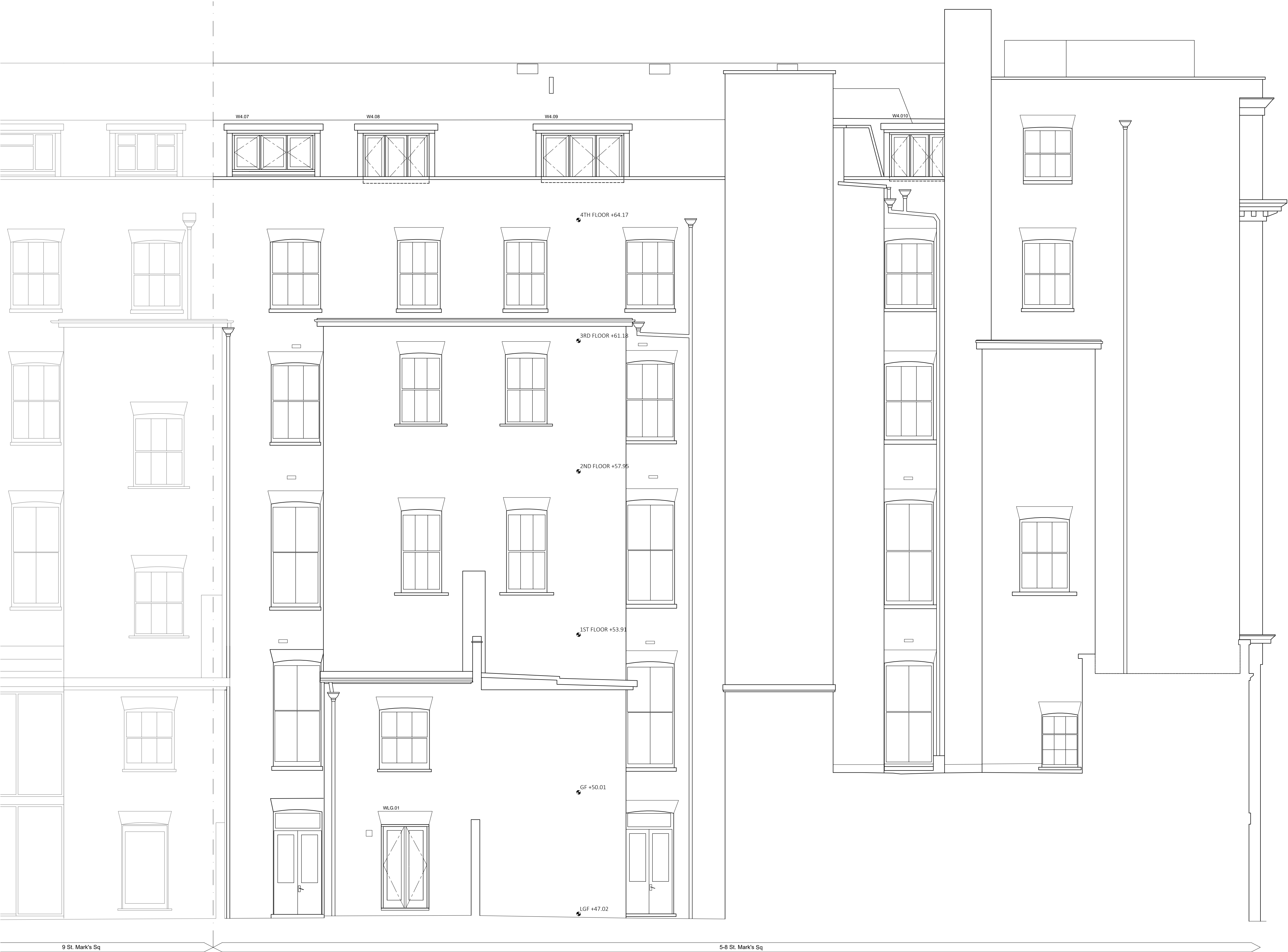
01 Proposed north elevation 1:50 @ A1 / 1:100 @ A3