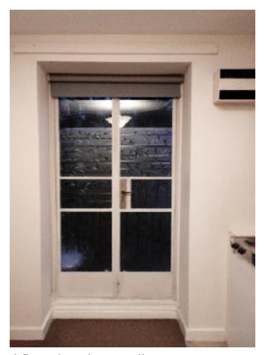
Figure 1 (left): Lower ground floor door (external). Figure 2 (right): Lower ground floor door (internal).