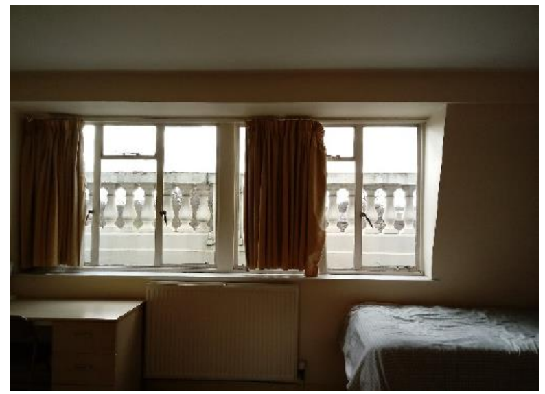
Figure 5: Fourth floor window (internal)