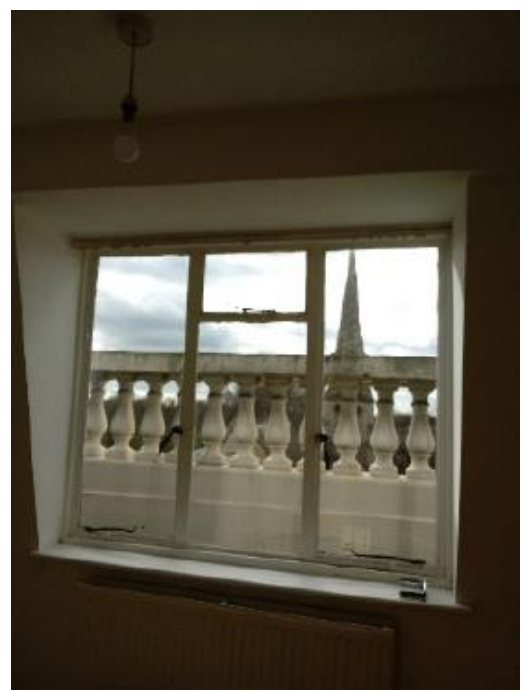
Figure 3 (left): Fourth floor window (external). Figure 4 (right): Fourth floor window (internal).