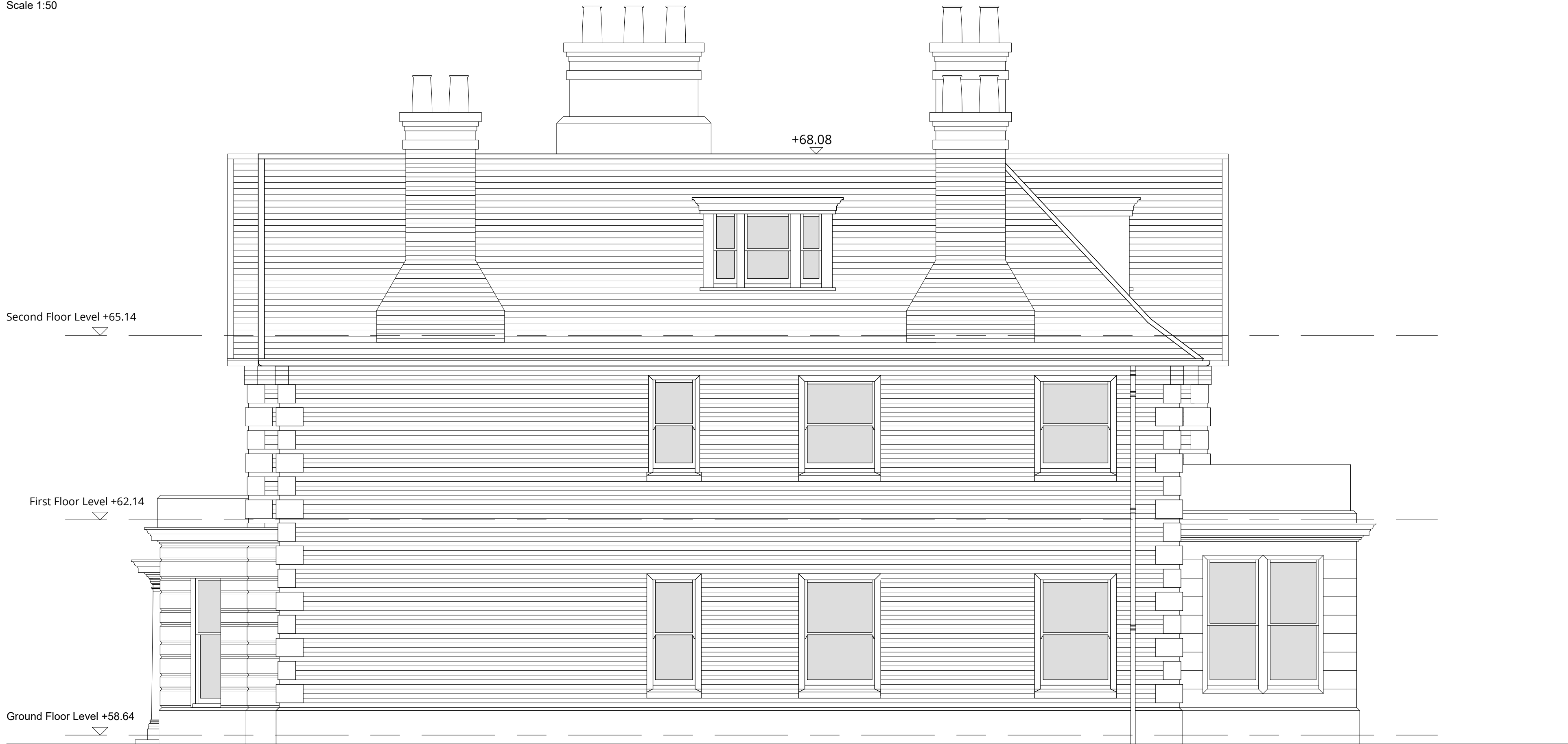
Proposed Flank Elevation (West) Scale 1:50