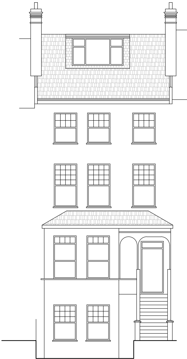
FRONT ELEVATION (ALL WINDOWS TO MATCH EXISTING)