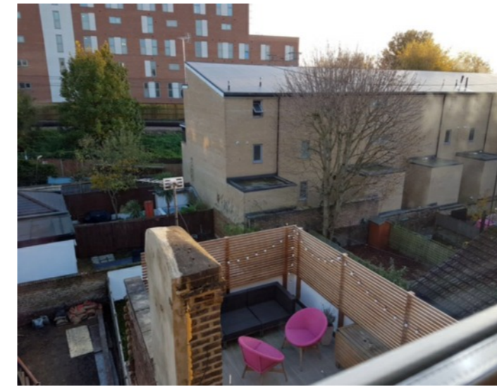
Aerial view of roof terrace at no.156 Iverson Road