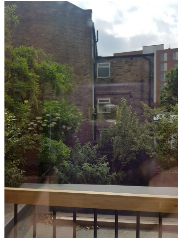
View from 1 st floor window at no.160