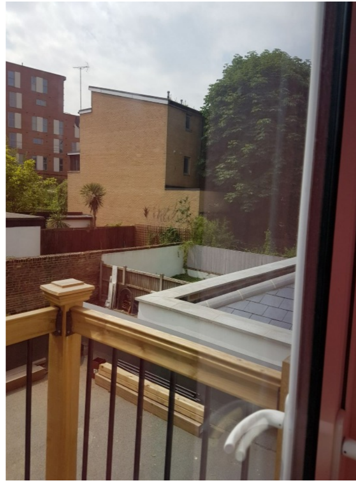
View from 1 st floor rear window at no 160