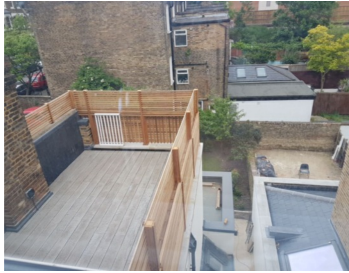
Aerial view of flat roof and approved roof terrace (2016/6650/P)