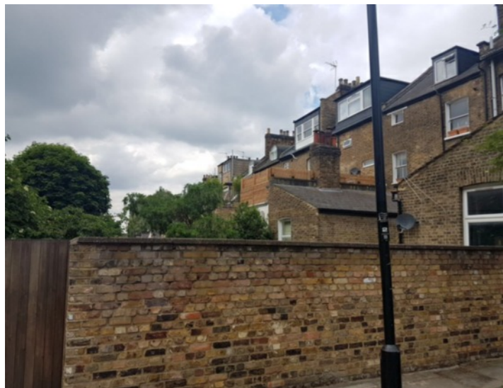
View of rear of 160 Iverson Road from Medley Road