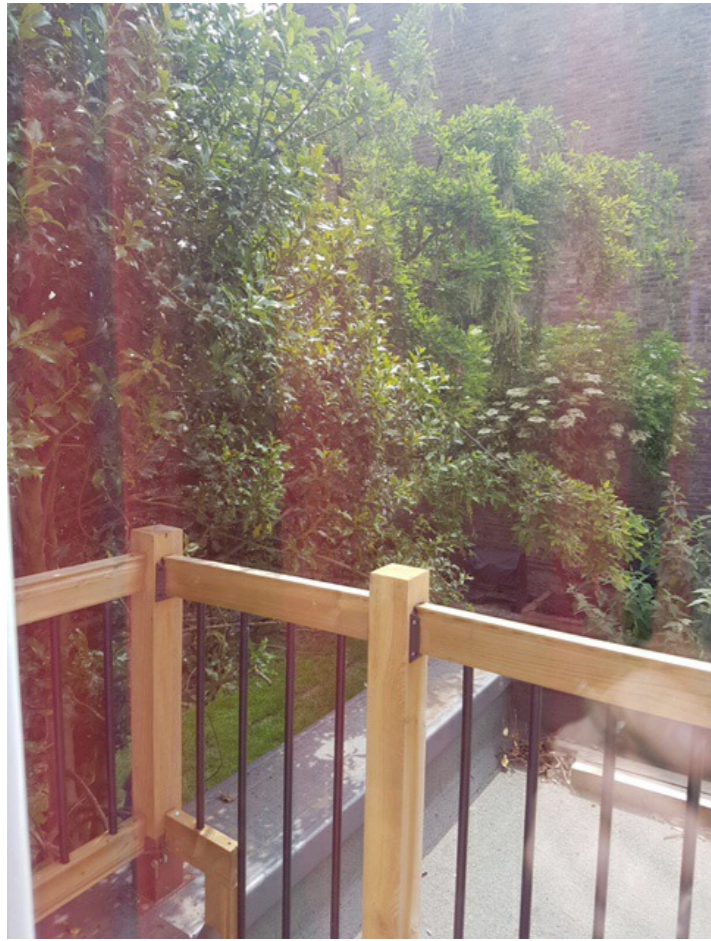
View from 1 st floor rear window towards rear of no. 160