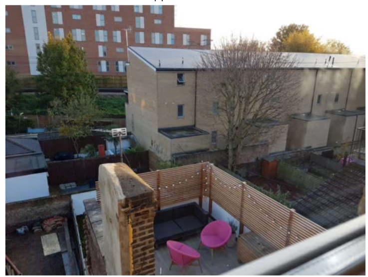
Aerial view of roof terrace at no.156 Iverson Road