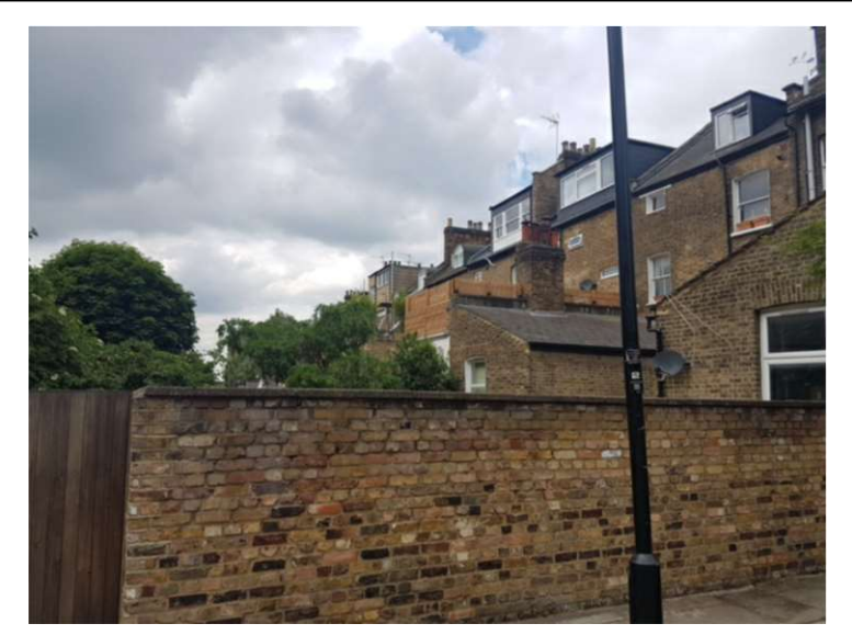
View of rear of 160 Iverson Road from Medley Road