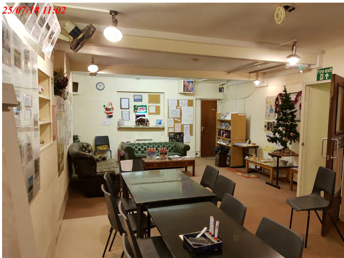
Photograph of basement (central and front area) showing language school use