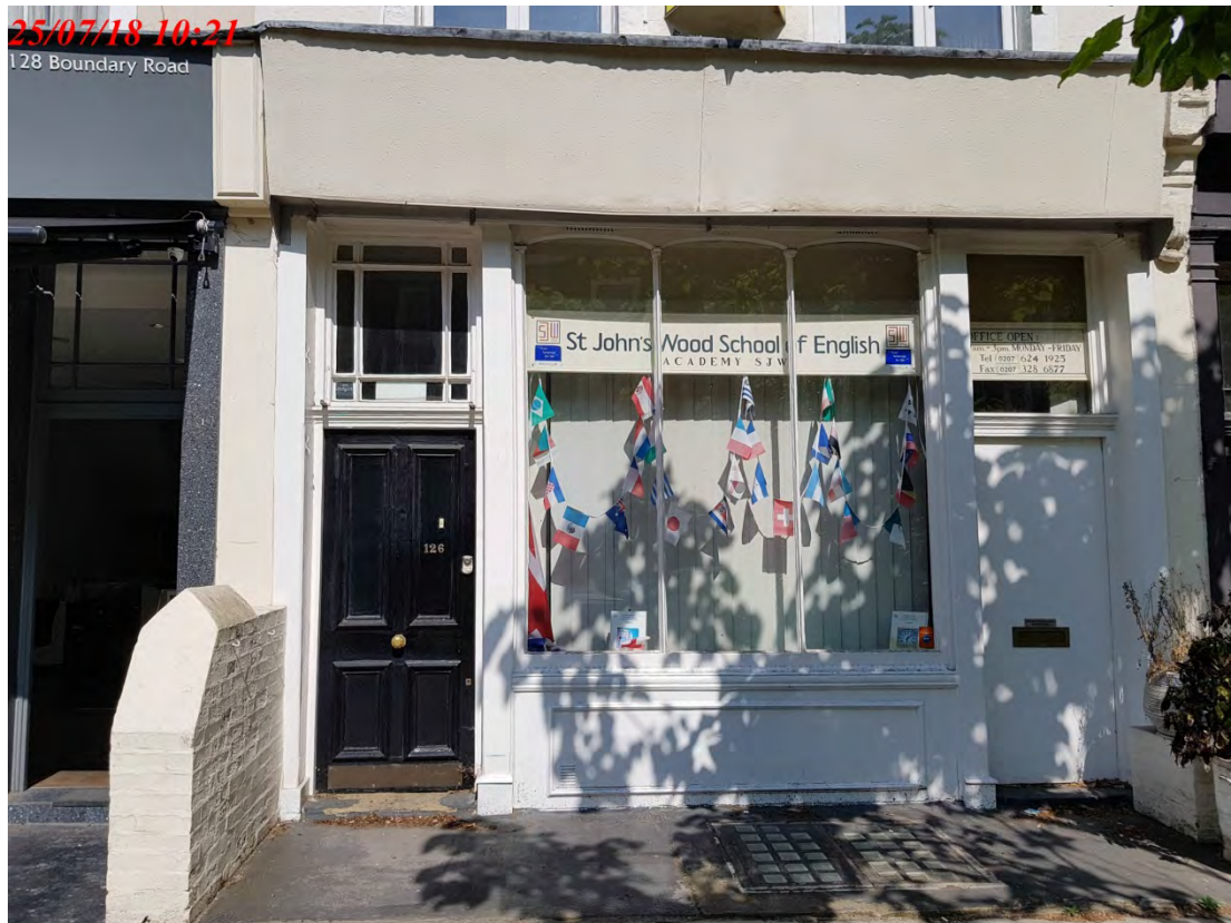
Photograph of exterior of property showing language school use of ground floor