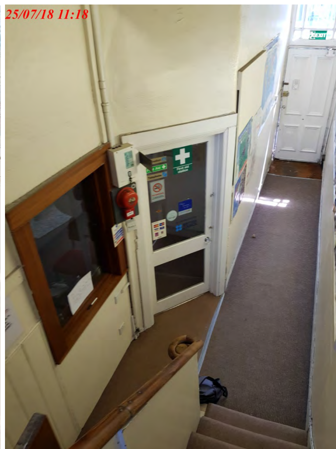
Photograph from ground floor entrance door towards stairs and photograph from stairs towards ground floor and entrance door. Shows ground floor connected to main entrance and not in separate use from rest of building