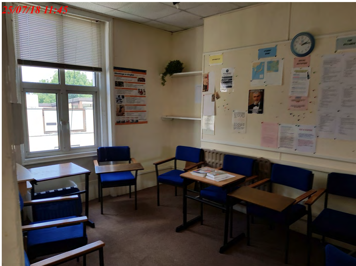
Photographs of first floor (rear area) showing language school use