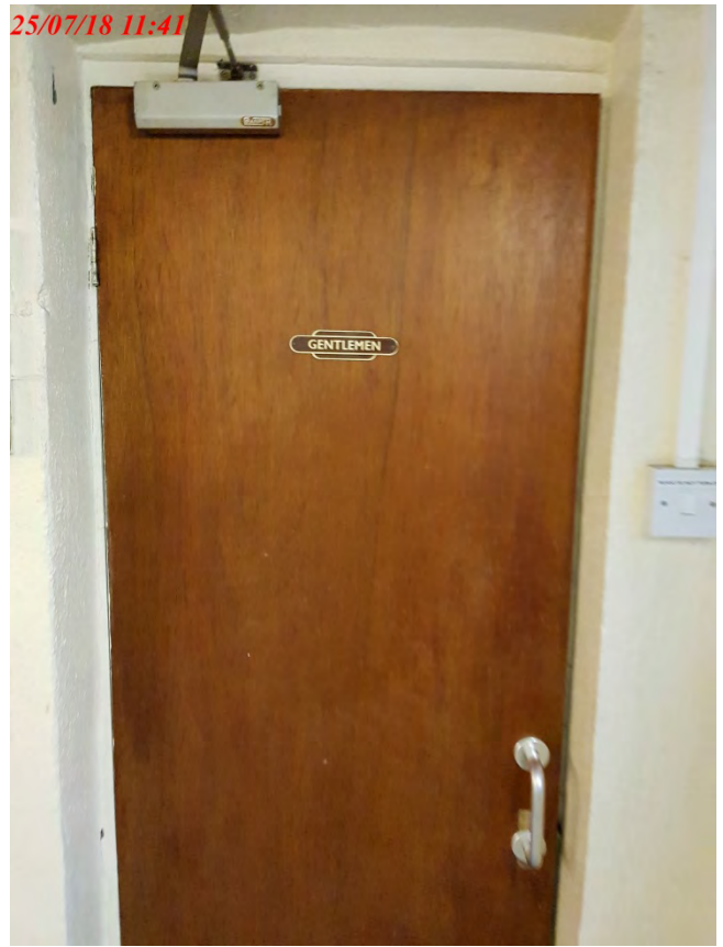
Photographs of only bathrooms in building (rear area of basement)