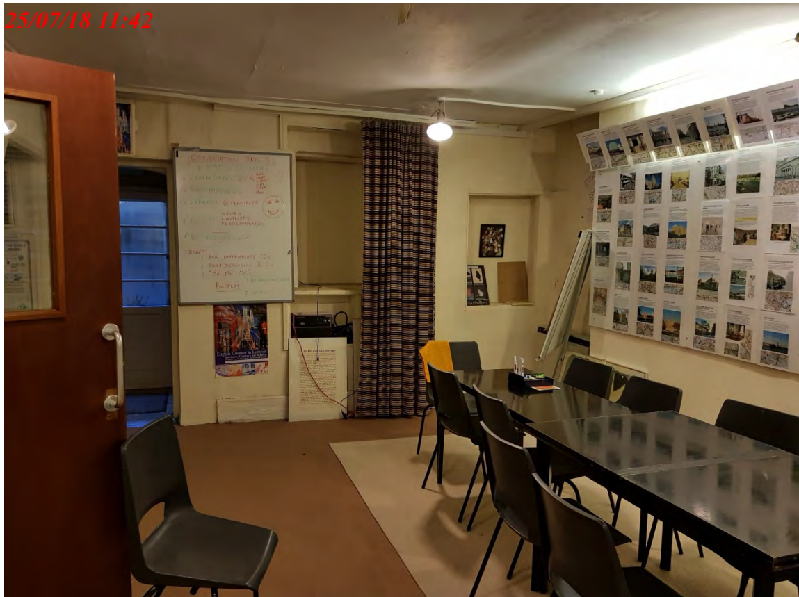
Photograph of basement (central area) showing language school use and door to rear area