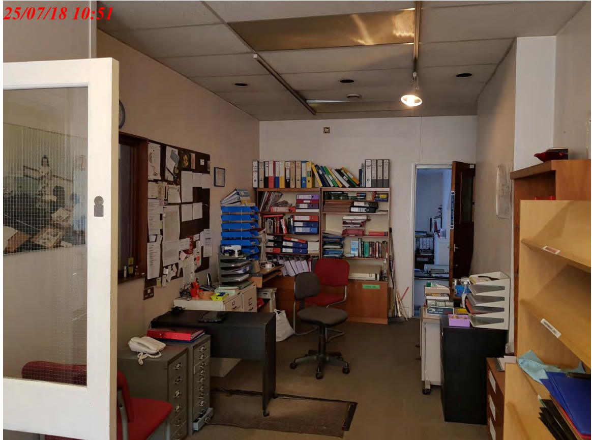
Photograph of ground floor (central area) showing language school use