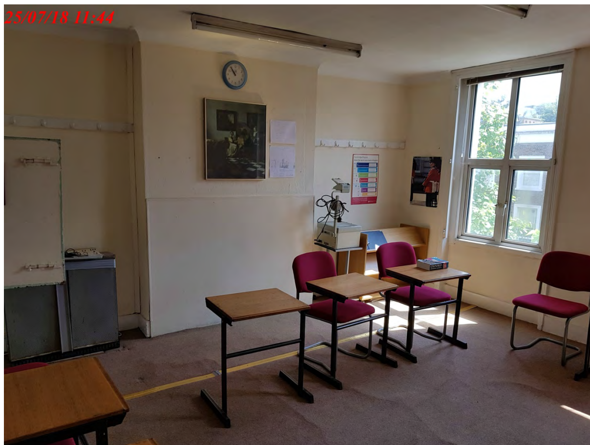
Photographs of first floor (front area) showing language school use