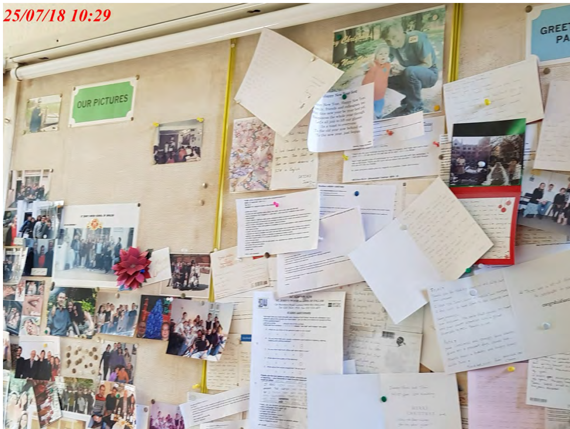
Photograph of noticeboard in entrance hall showing language school use