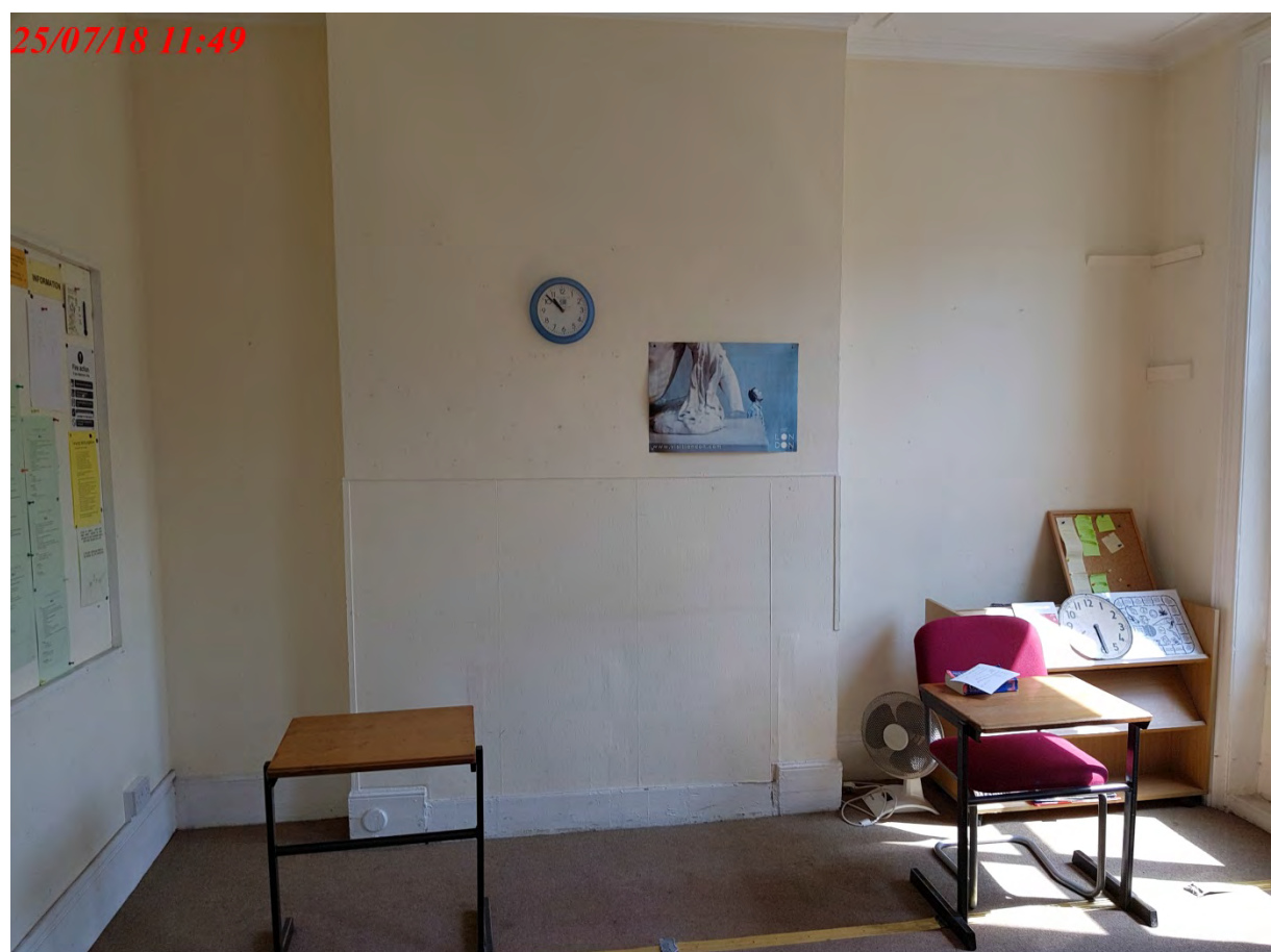
Photographs of second floor (front area) showing language school use