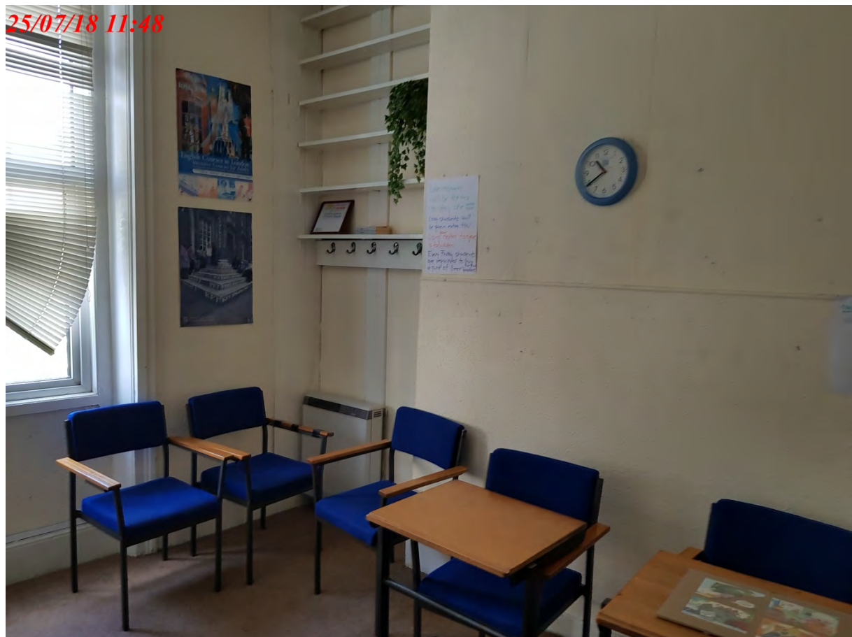
Photographs of second floor (rear area) showing language school use