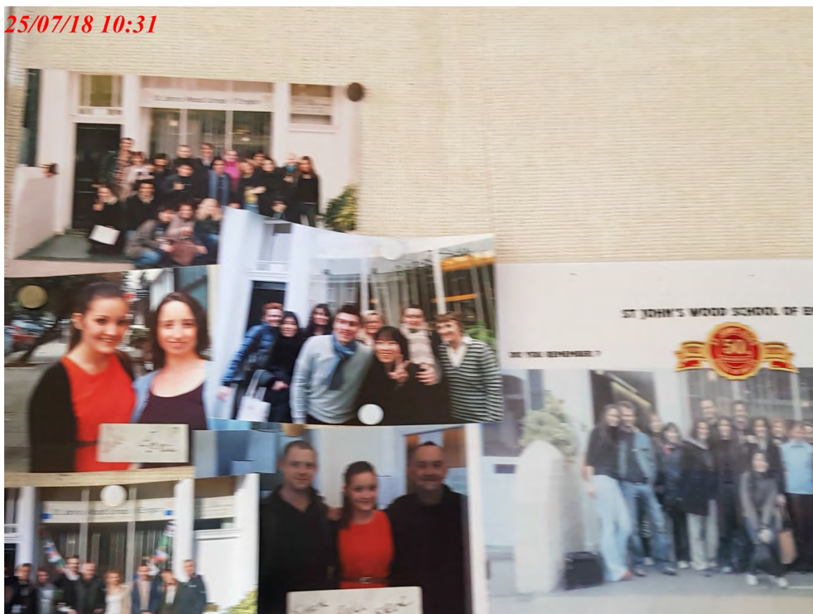
Photograph of noticeboard in entrance hall showing historic photographs of language school use