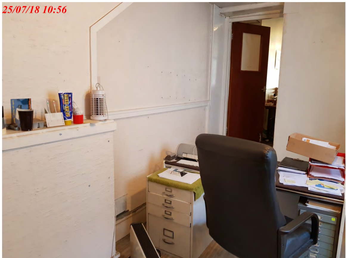
Photograph of ground floor (rear area) showing language school use