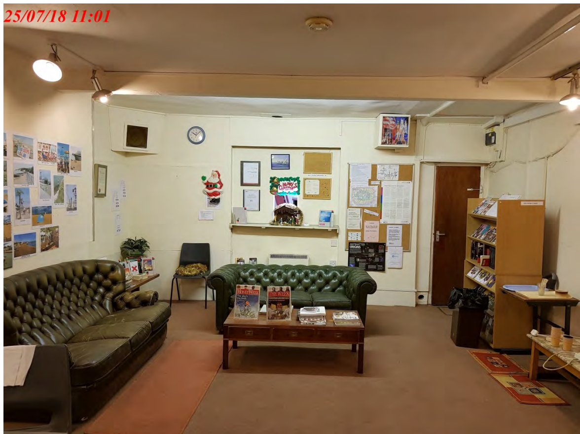
Photograph of basement (front area) showing language school use