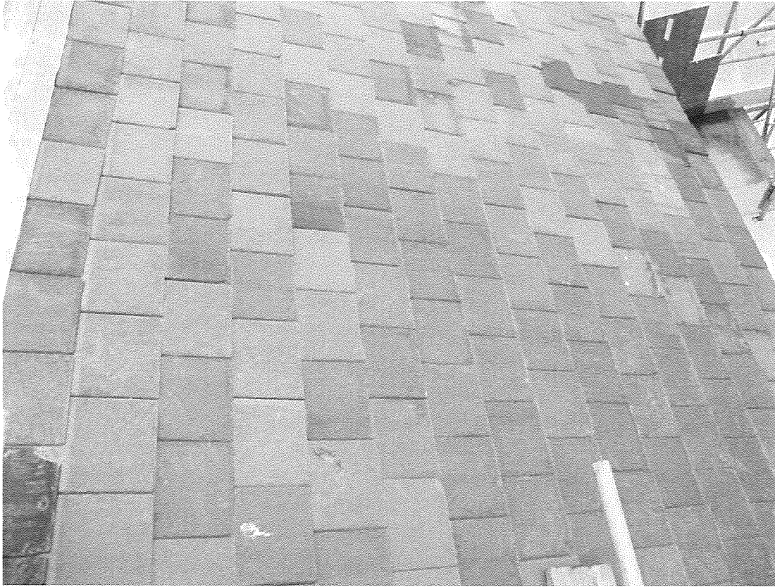
Photo 3: Second Hand slates ( some salvaged some imported) as 2017 works