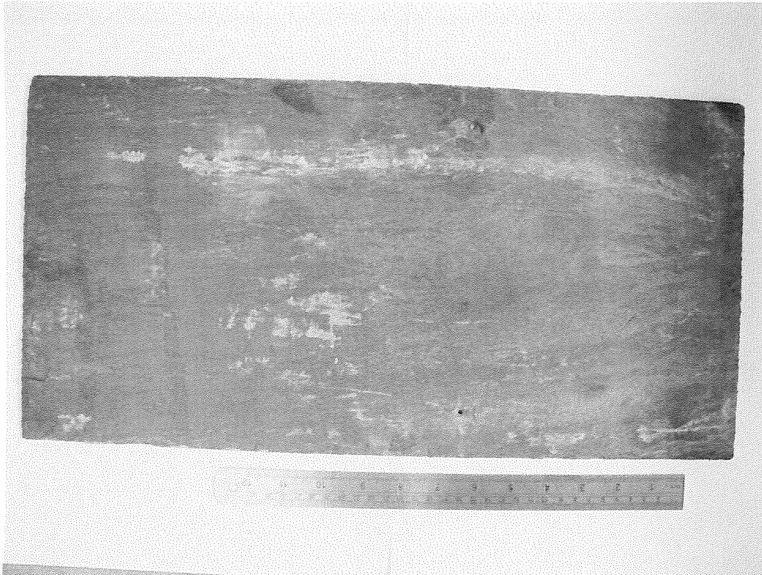
Photo 01: Slate sample 01 grey slate is from the CWT-Y-BUGAIL quarry