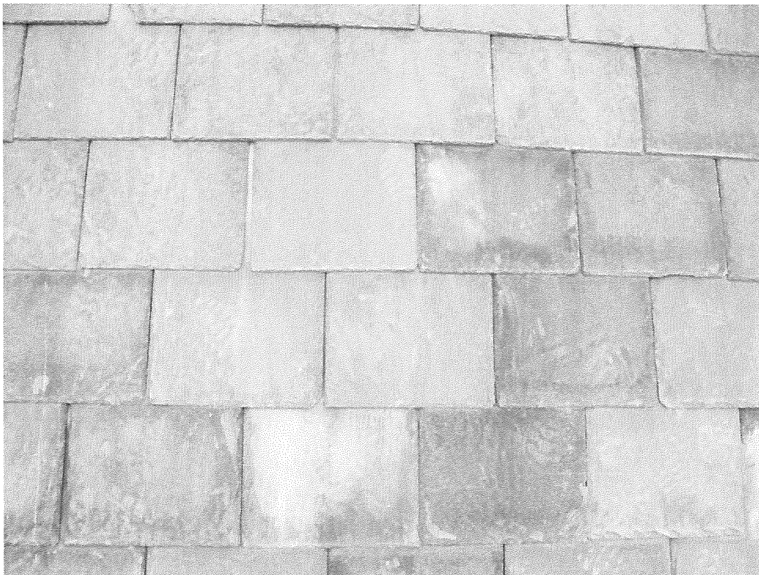
Photo 4: Second Hand slates Mixture of slates used on roof : Margin 250 wide x 200