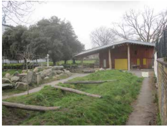
Existing timber balancing logs to be removed. Existing grass mounds partially to be reshaped.