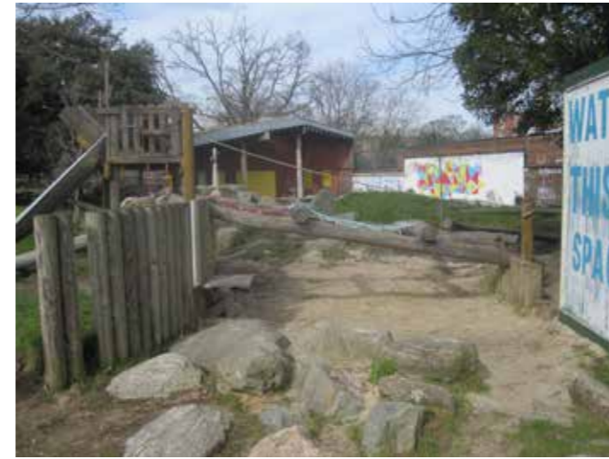
Existing boulder mound, timber bridge and timber tower with small slide to be removed. Boulders to be reused on site.