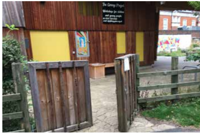
Existing timber gate to be replaced with flat top metal gate to match fence