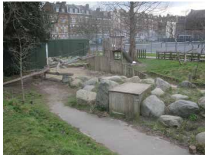
Existing utilities meter behind timber casing. Casing to be removed and replaced with new.