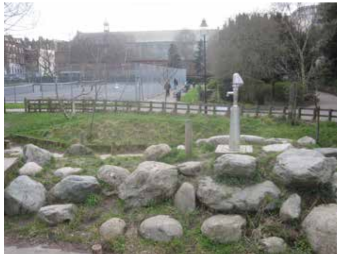
Existing boulder mound and water pump to be removed. Boulders to be reused on site.