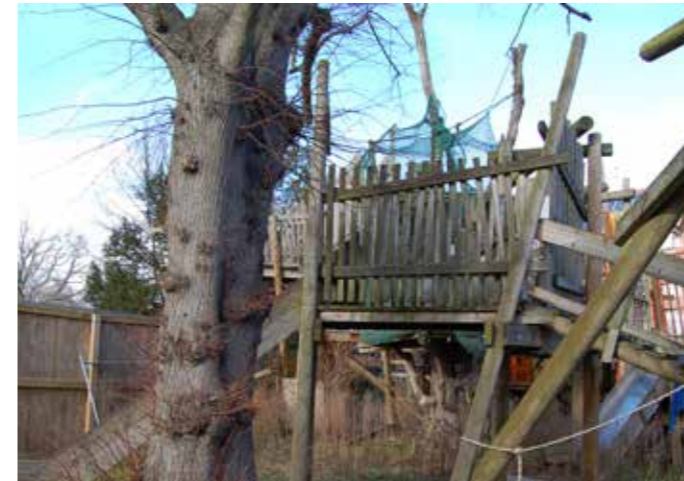
Existing decommissioned adventure play structure to be removed.