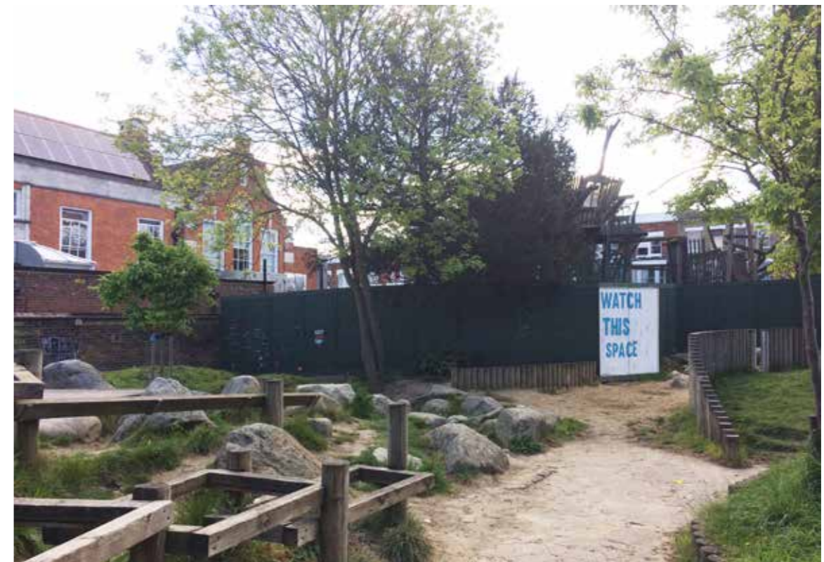
View of existing playground looking south