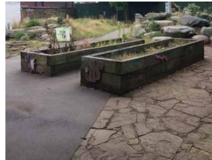
Existing raised planters to be removed.