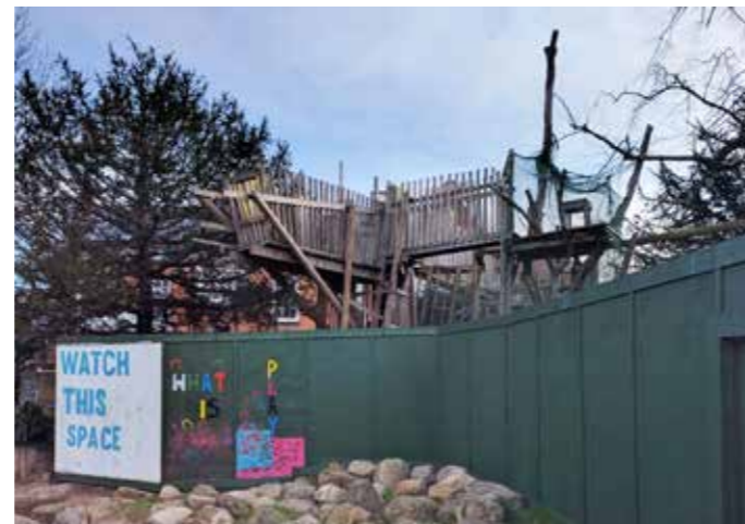
Existing hoarding and decommissioned adventure play structure behind to be removed.