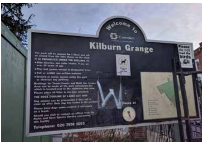
Existing park signage to remain. New fence behind.