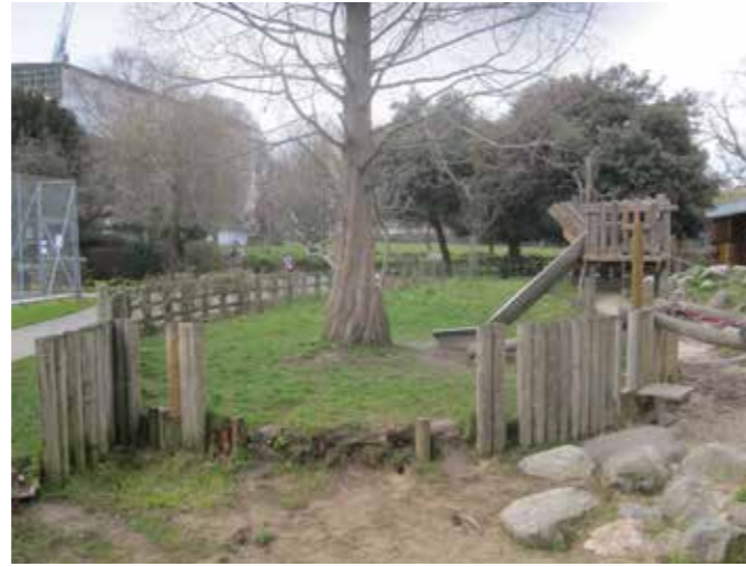
Existing palisading to be removed. Edge to be held with new retaining edge and bench.