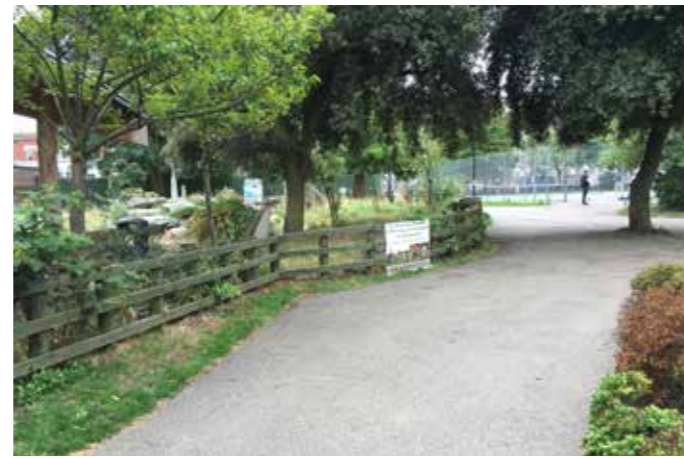
Existing timber post and rail fence to be replaced with flat-top railing and hedging