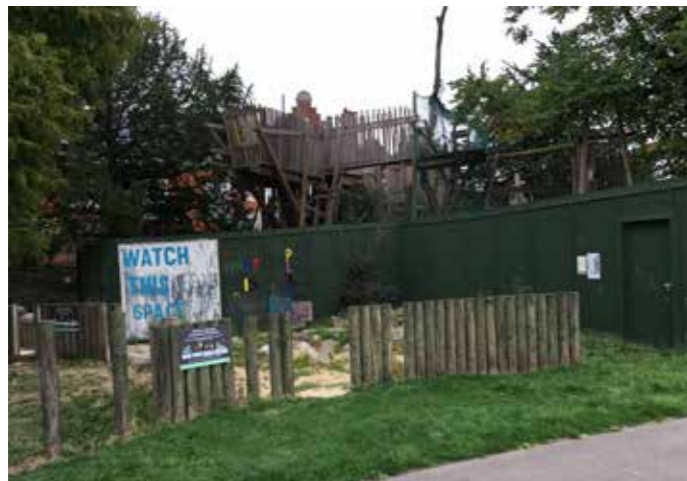
Existing timber palisade boundary to be replaced with flat-top railing and hedging.