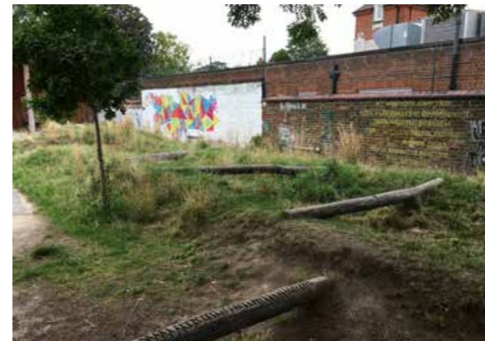
Existing brick boundary wall towards Kingsgate Primary School with fire fencing above (all to remain as existing).