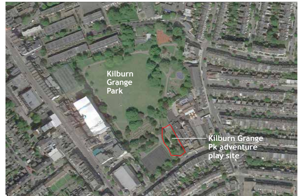
Aerial view - Not to scale

The wider park is open daily from dawn to dusk. This application does not propose changes to the opening hours.