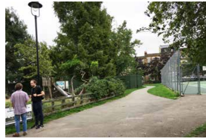
Existing timber post and rail fence to be replaced