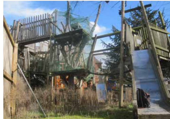
Existing decommissioned adventure play structure to be removed.