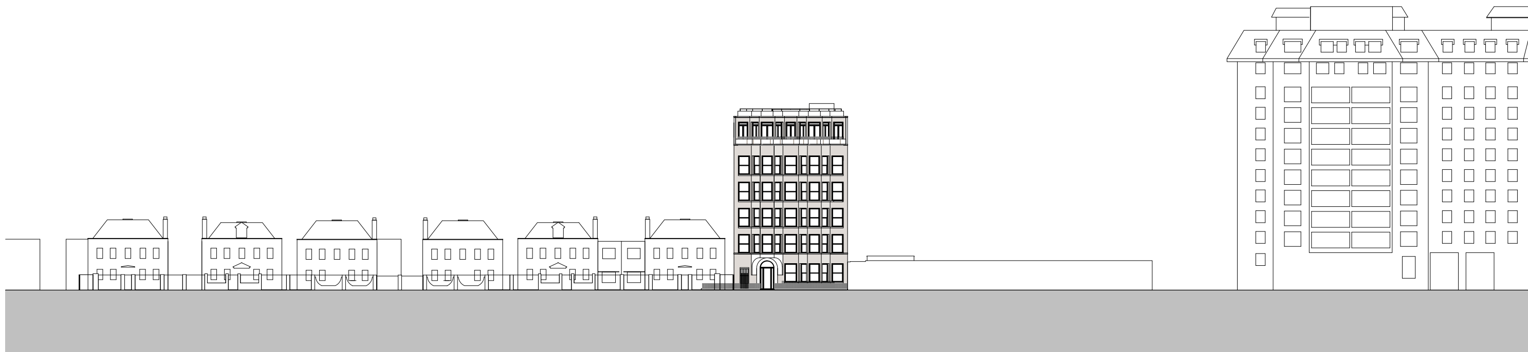
Proposed St John's Wood Park Elevation