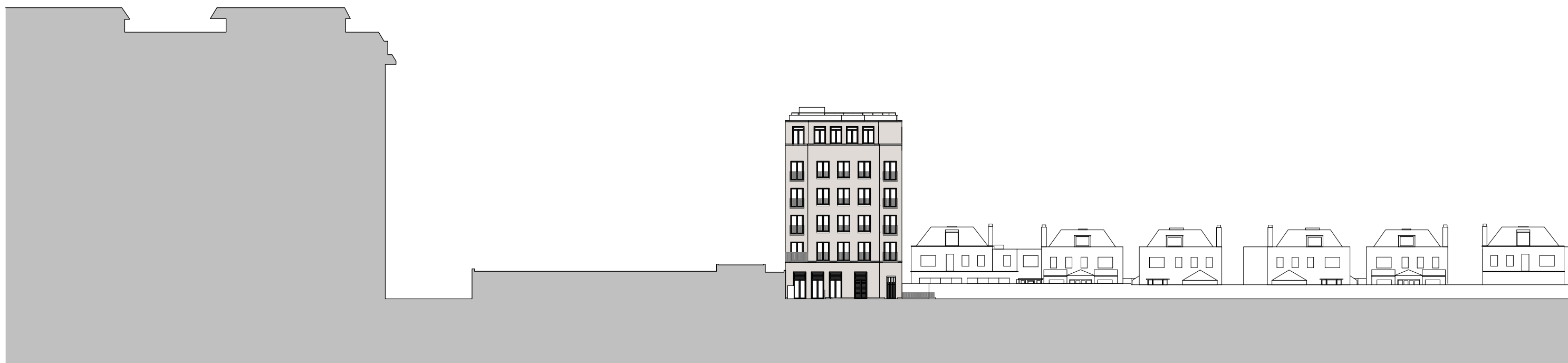
Proposed Middlefield Elevation

Do not scale from this drawing. Verify all dimensions on site. Drawing should be read in conjunction with information from all other design consultants and contractors. All drawings in digital format are for reference only, paper copies are available on request.