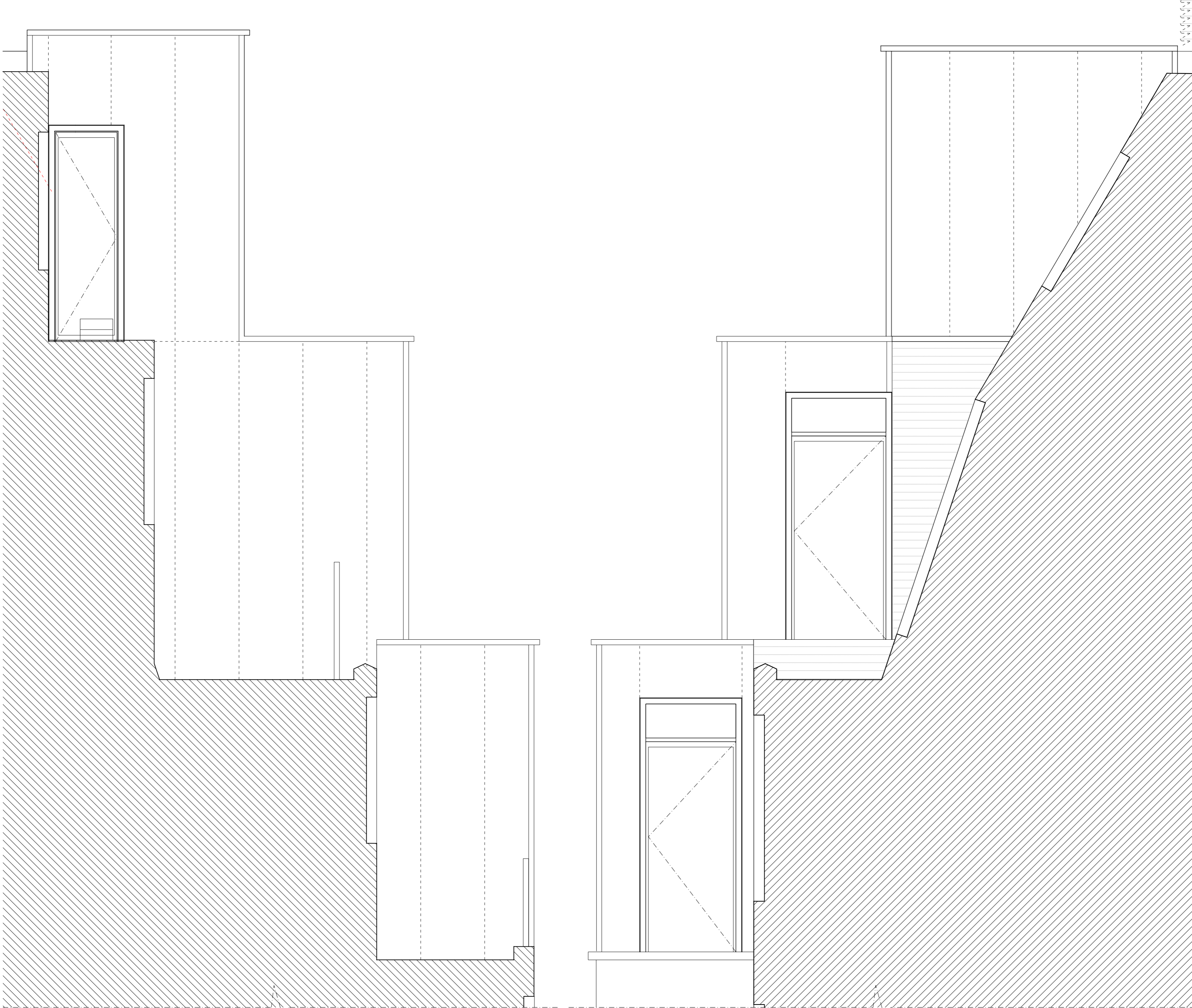
B 500_201 Proposed East Elevation _ Zinc Set out Elevation 1:25