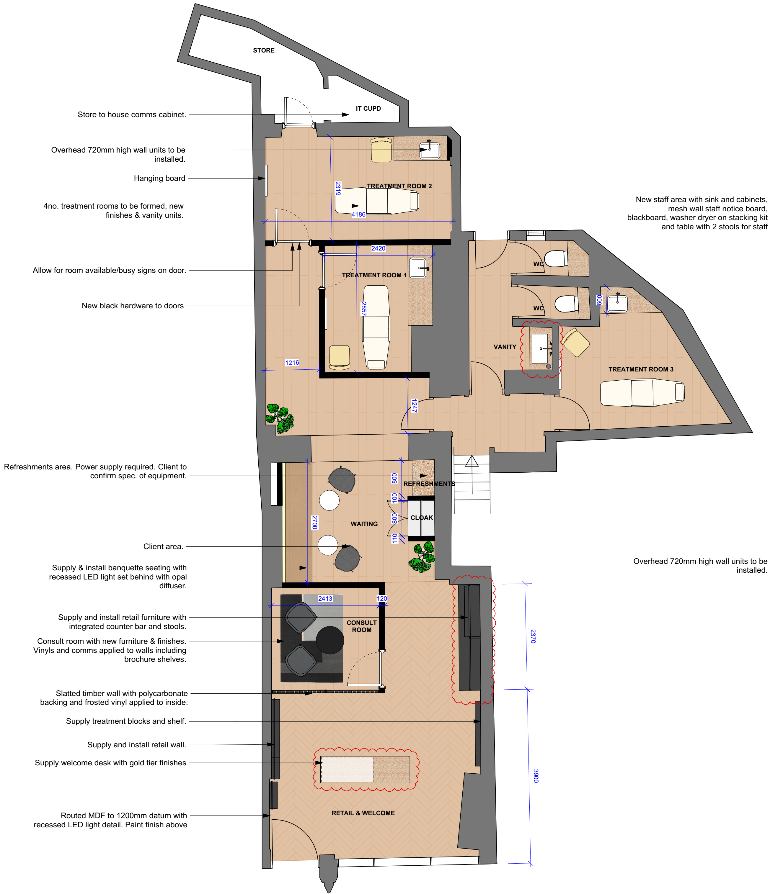
1 Ground Floor Proposed Plan Scale: 1:50

PLEASE NOTE: ALL DRAWINGS ISSUED BY YOURSTUDIO ARE BASED ON THE ORIGINAL ARCHITECT'S DRAWINGS PROVIDED BY THE LANDLORD. THEY DO NOT REFLECT AS BUILT CONDITIONS. THE APPOINTED CONTRACTOR MUST UNDERTAKE FULL SURVEY OF SITE TO ESTABLISH ALL DIMENSIONS AND ENSURE ACCURATE SETTING OUT PRIOR TO CONSTRUCTION.