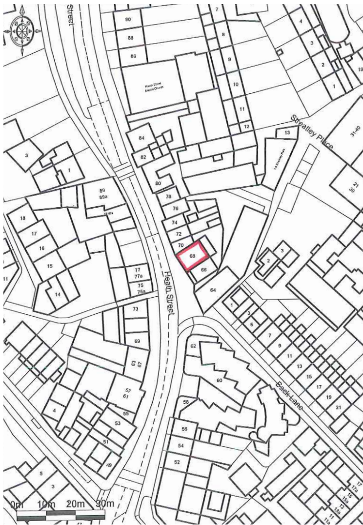
3 Site Plan Scale: 1:1250