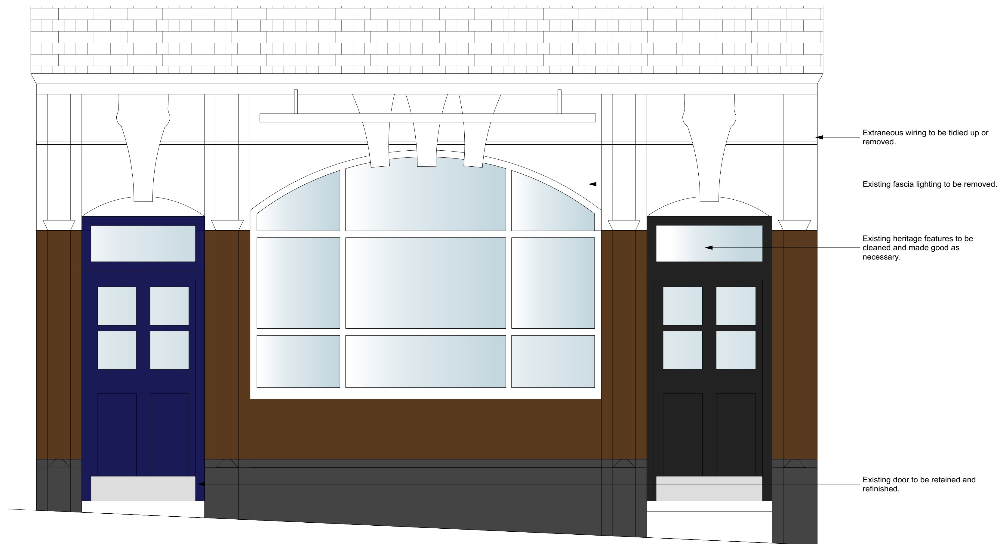
1 Existing External Elevation Scale: 1:20