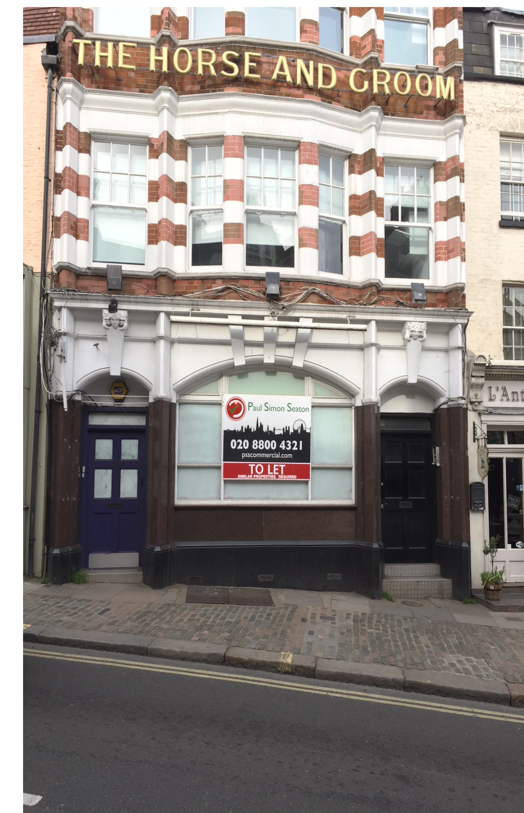
2 External Elevation reference Scale: Not to Scale

PLEASE NOTE: ALL DRAWINGS ISSUED BY YOURSTUDIO ARE BASED ON THE ORIGINAL ARCHITECT'S DRAWINGS PROVIDED BY THE LANDLORD. THEY DO NOT REFLECT AS BUILT CONDITIONS. THE APPOINTED CONTRACTOR MUST UNDERTAKE FULL SURVEY OF SITE TO ESTABLISH ALL DIMENSIONS AND ENSURE ACCURATE SETTING OUT PRIOR TO CONSTRUCTION.