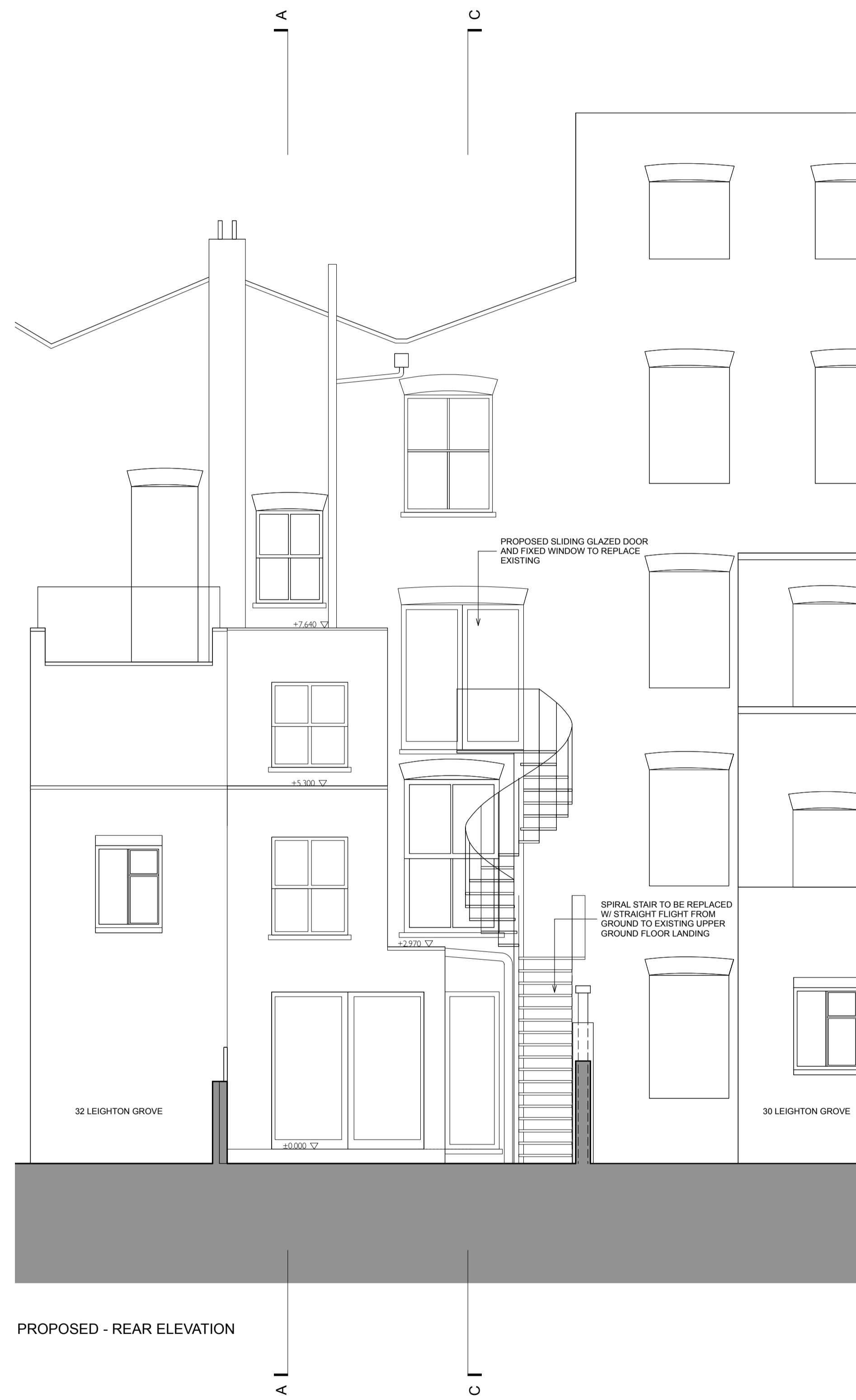
PROPOSED - REAR ELEVATION