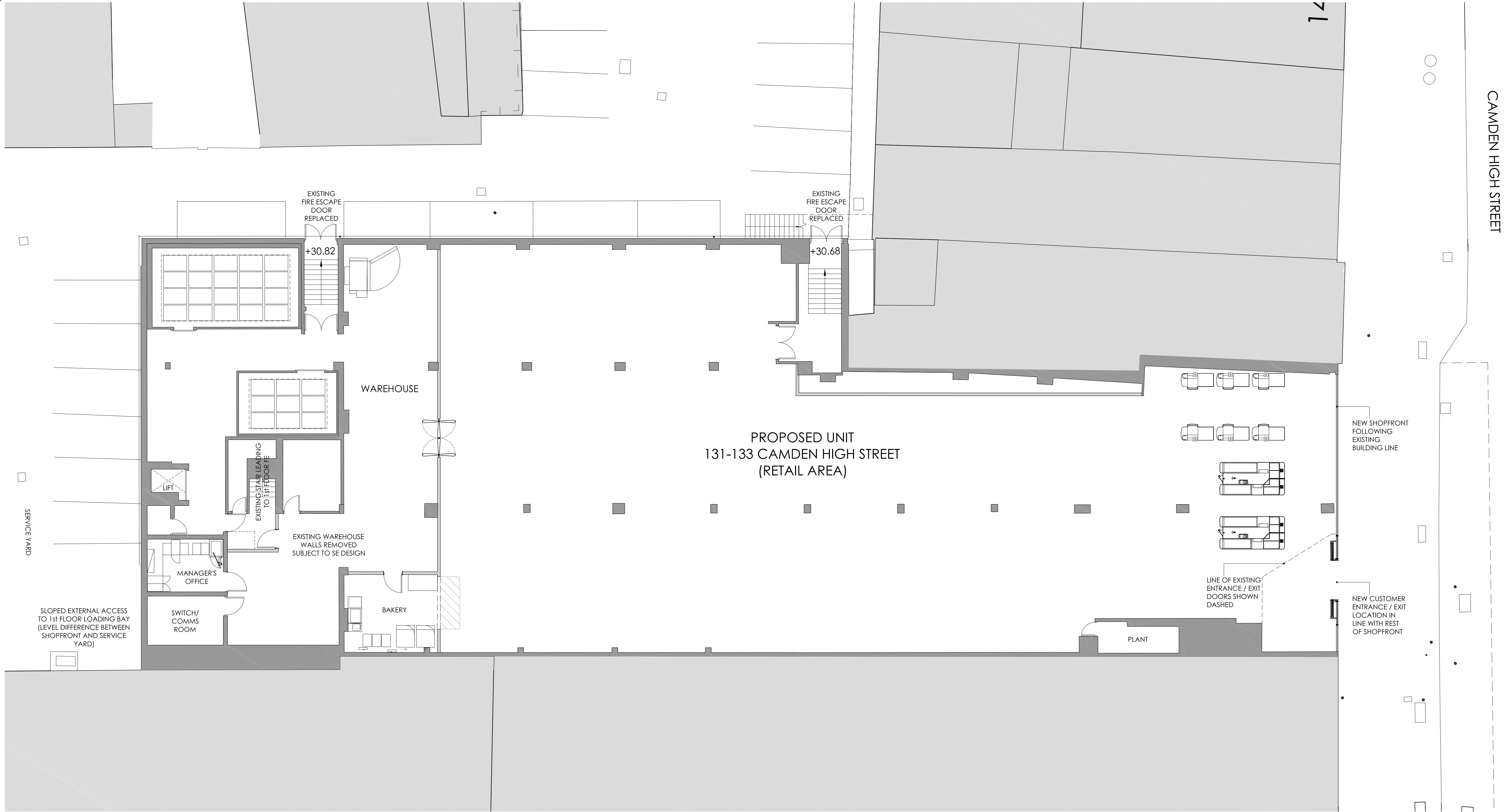
01 PROPOSED GROUND FLOOR PLAN 1:100