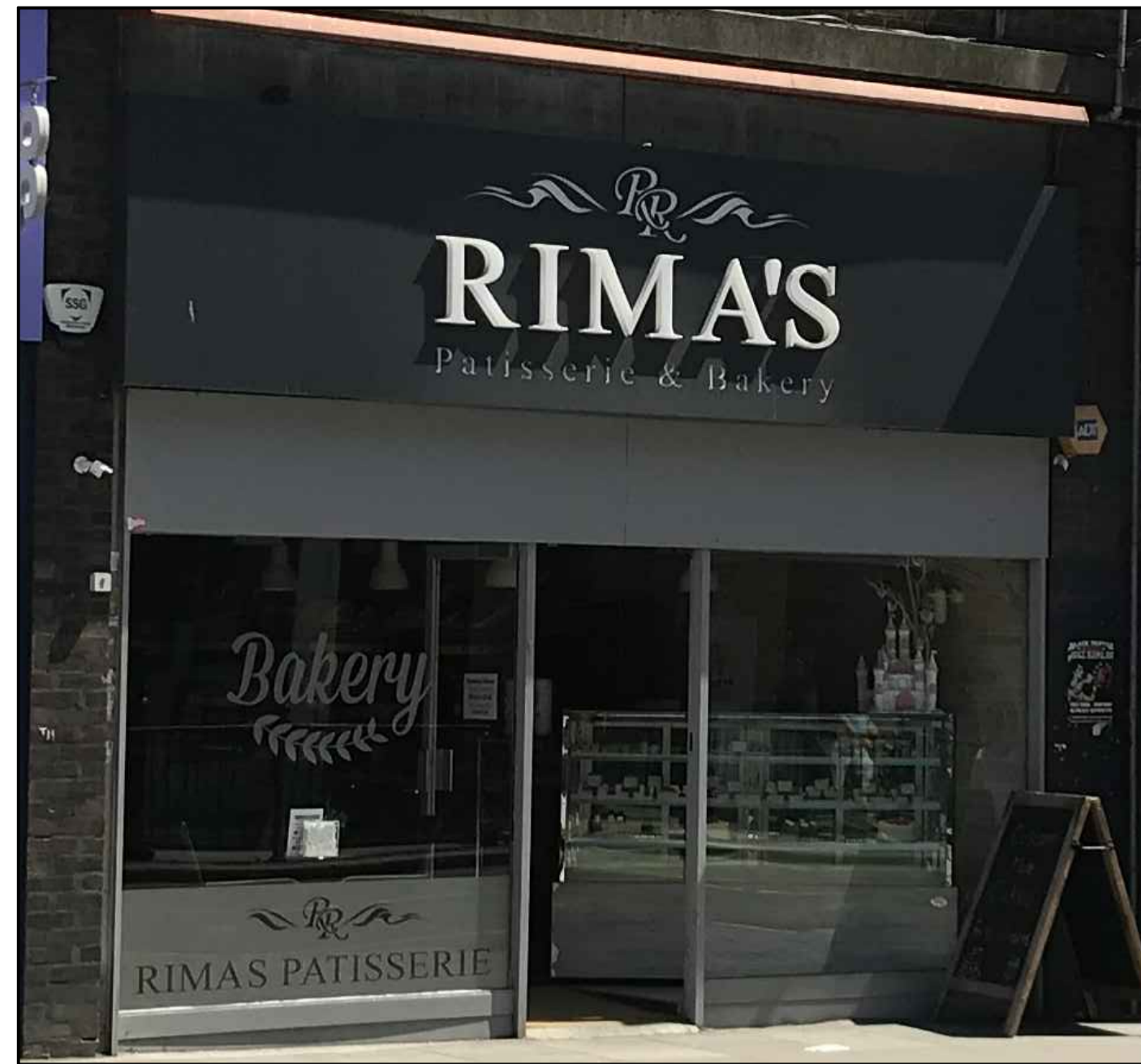
existing shopfront elevation photo scale - NTS