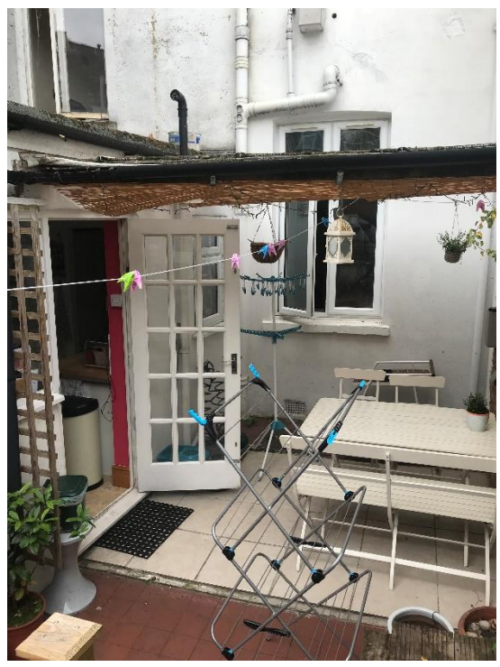
Figure 2. Existing rear elevation and extension views