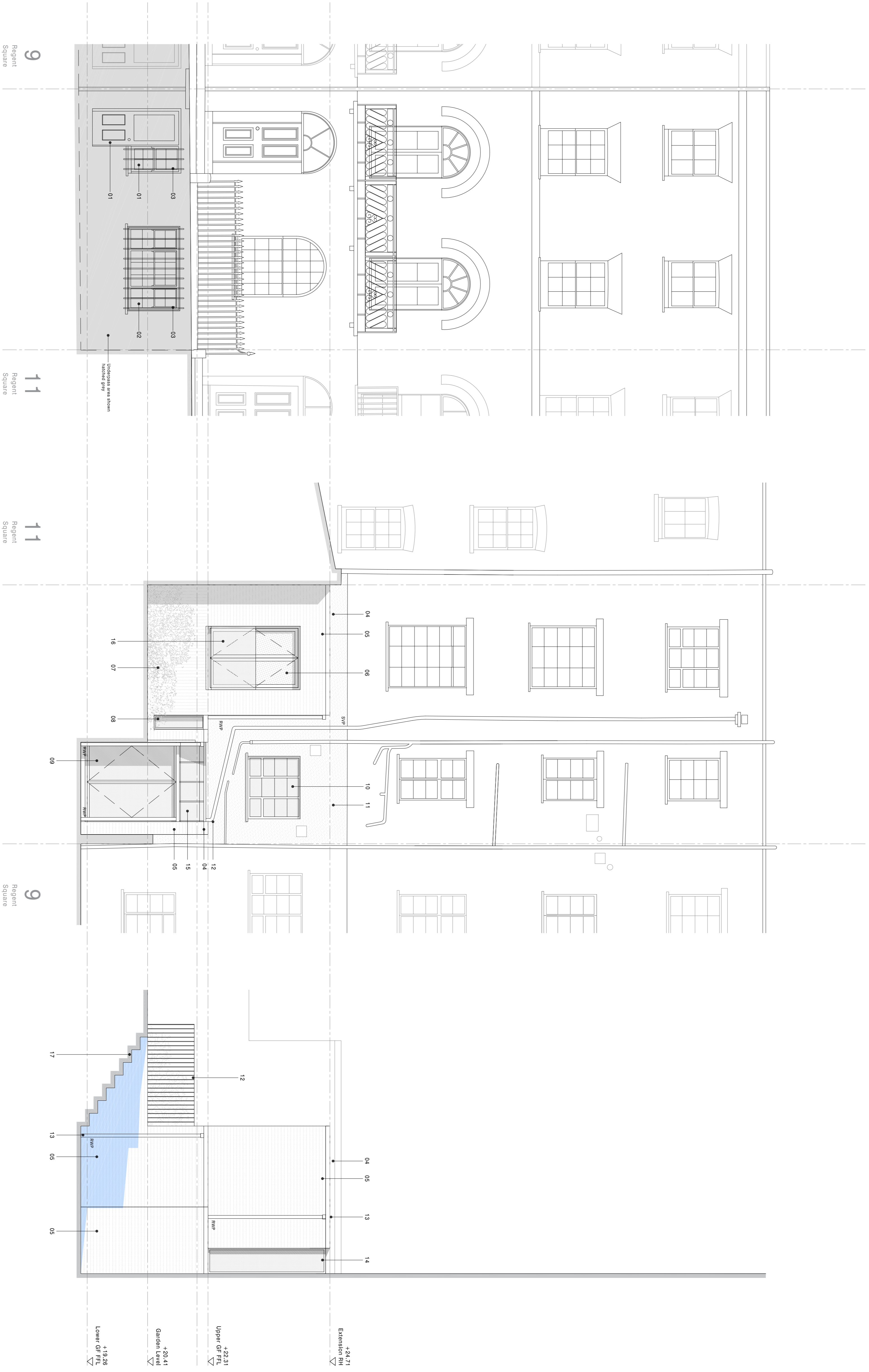
PROPOSED FRONT ELEVATION (1) North