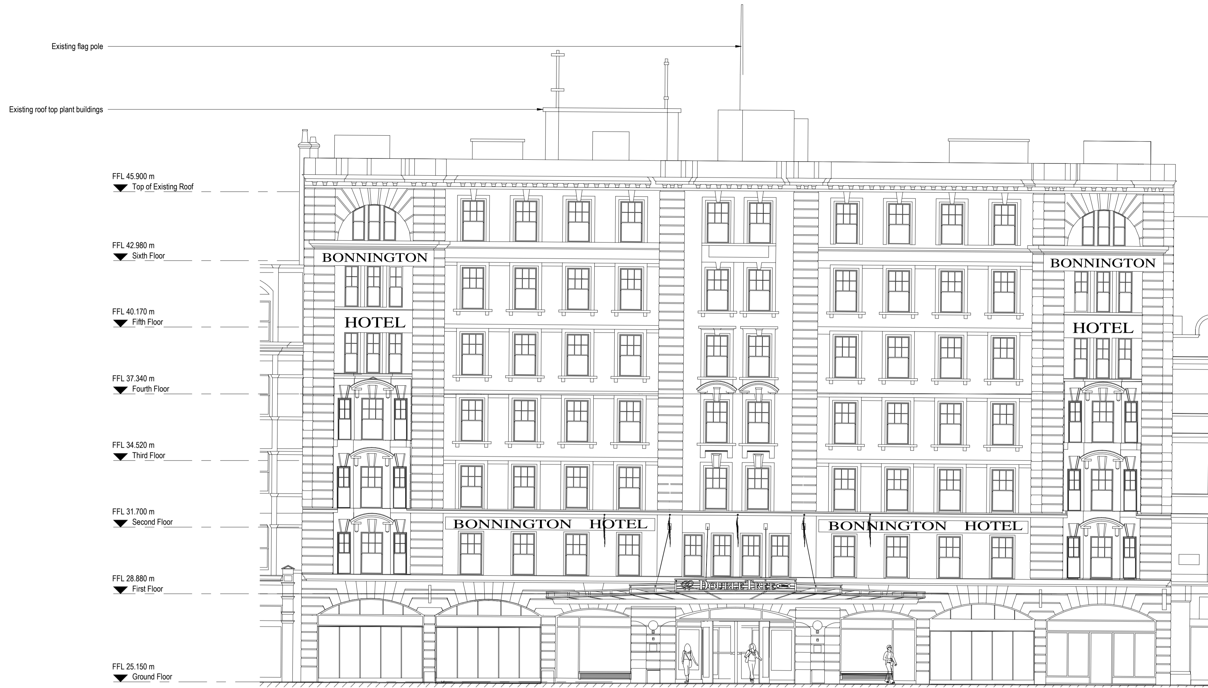
1 Existing Elevation - Southampton Row 1 : 100