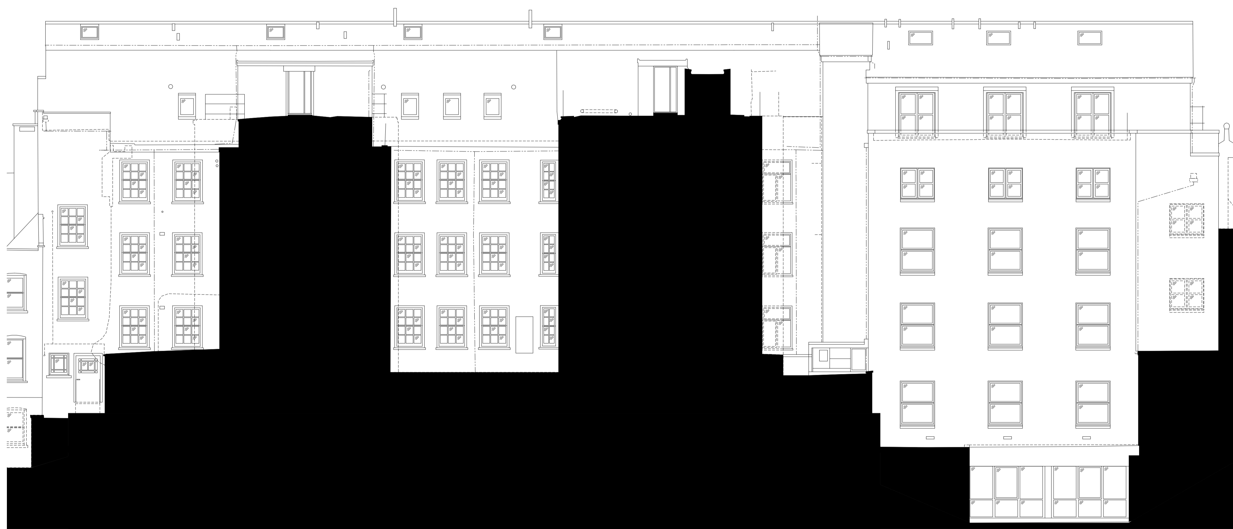
1 Section D-D - Rear Elevation - Existing 1 : 100