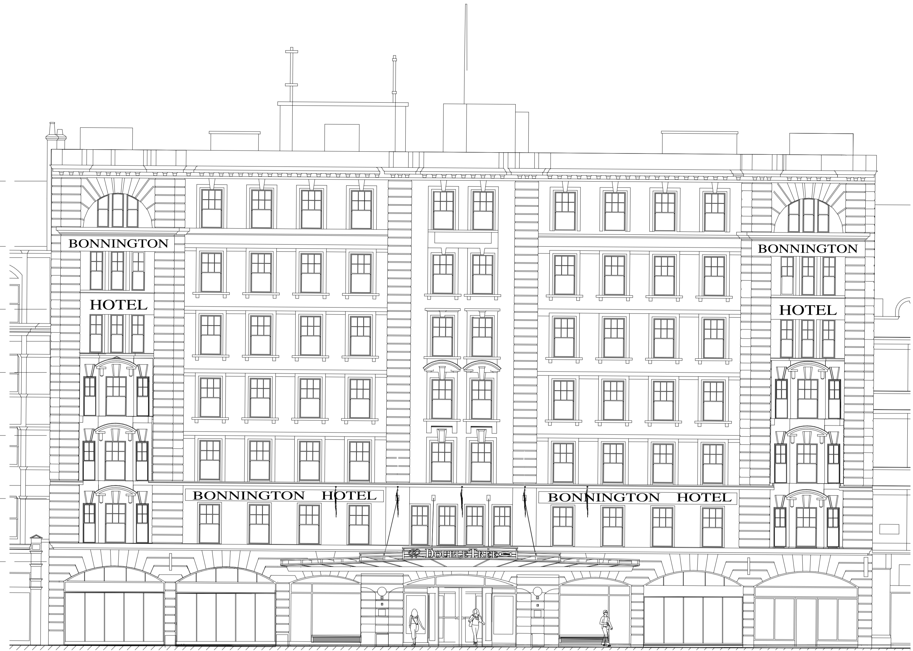
Proposed Elevation - Southampton Row 1 : 100

FFL 45.900 m ▼ Top of Existing Roof FFL 42.980 m ▼ Sixth Floor FFL 40.170 m ▼ Fifth Floor FFL 37.340 m ▼ Fourth Floor FFL 34.520 m ▼ Third Floor FFL 31.700 m ▼ Second Floor FFL 28.880 m ▼ First Floor