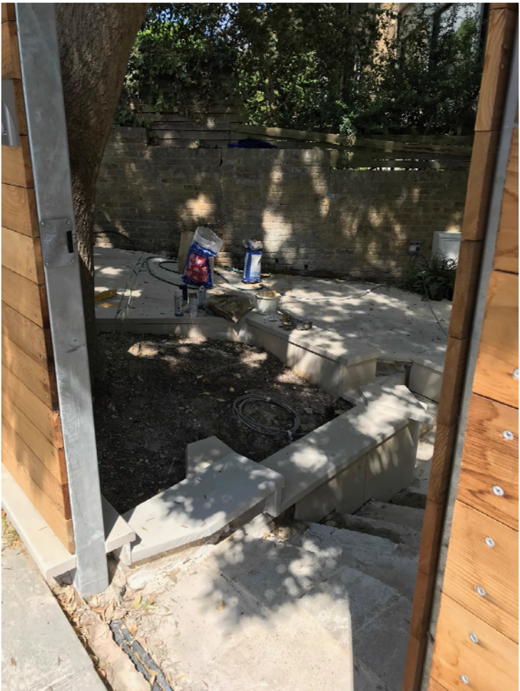
PHOTO 2 - ENTRANCE GATE