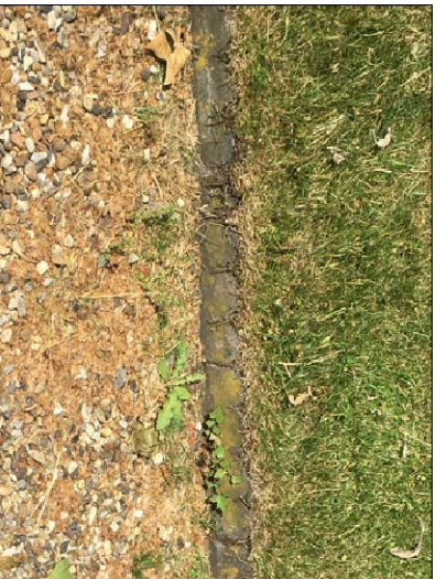
TYPE 3 - TILE EDGING