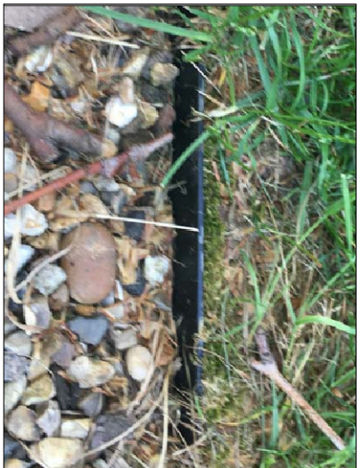
TYPE 1 - METAL EDGING