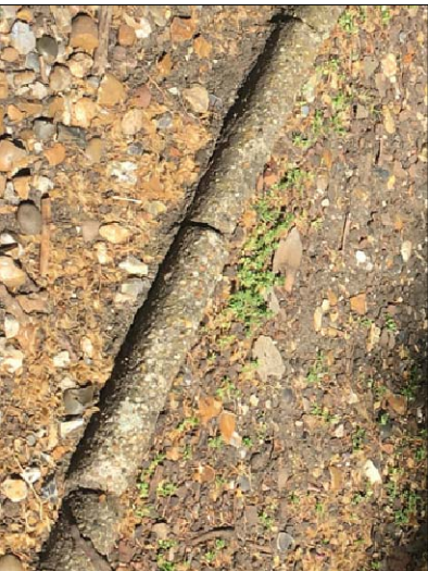
TYPE 2 - CONCRETE EDGING