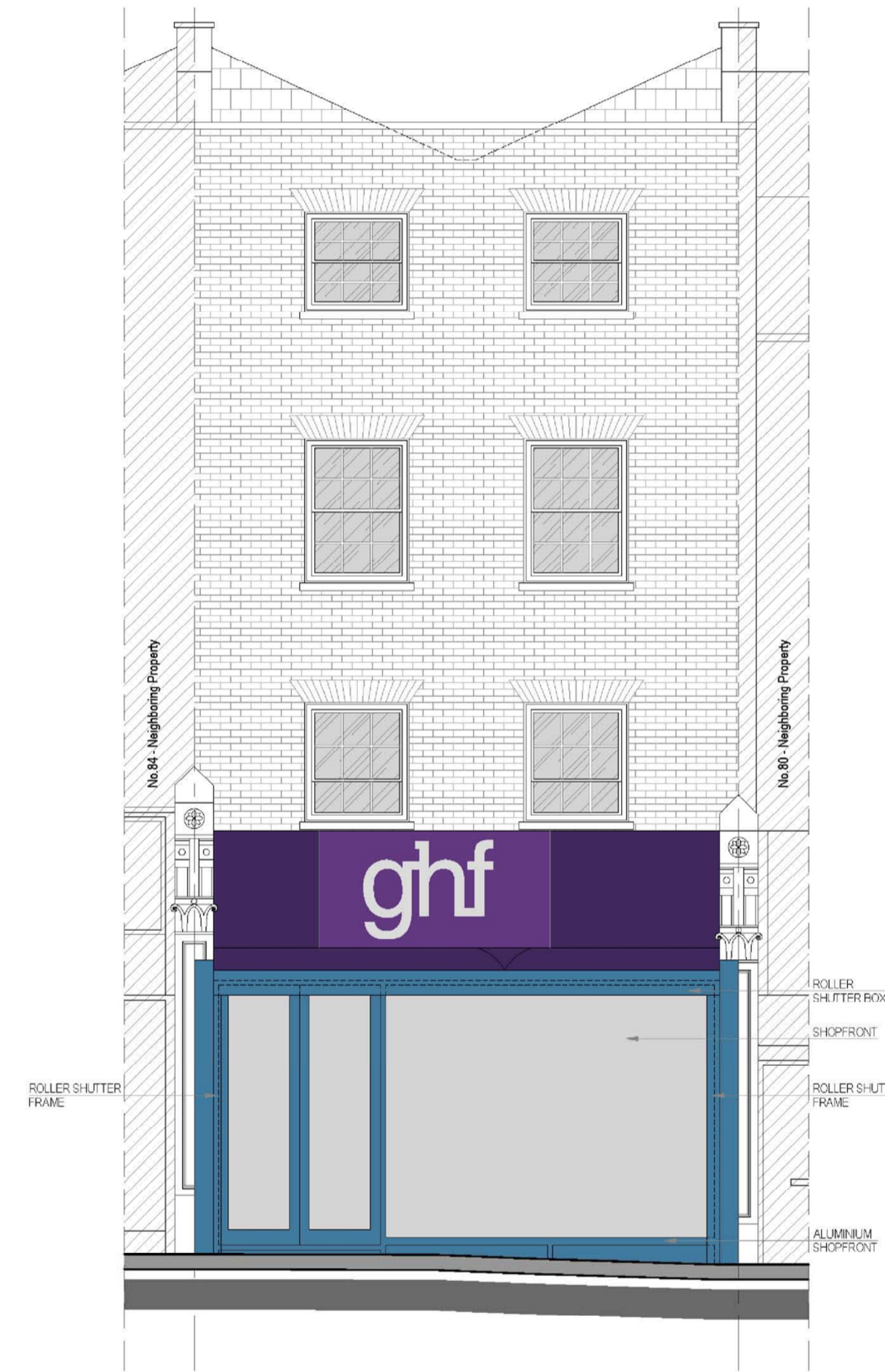
03 Existing Street Elevation 1:50 @ A1, 1:100 @ A3