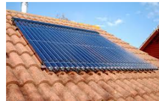
Figure 6 – Solar Thermal Panels

This heat energy is then moved down pipes to the hot water cylinder within the home, reducing the need to use Gas, Oil or Electricity to heat the hot water; for this development solar thermal panels could be used for hot water. The system has been considered not suitable for the scheme as it will not contribute sufficiently towards the sustainability performance of the development.