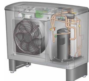
Figure 5 - External unit

Air source heat pumps are an efficient and environmentally-friendly way of heating using air drawn freely from the atmosphere. They operate rather like a refrigerator in reverse, absorbing heat from the air into a working fluid which is passed into a compressor where its temperature is increased before it is transferred into the heating and hot water circuits of the building. An air