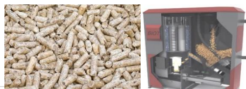
Figure 3 – Biomass Boiler and Wood Pellets