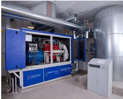
Figure 2 – Example of CHP unit

Hierarchy. CHP systems are usually specified for large schemes due to the need to have a large enough heat demand to supply from the CHP system. Plant room space is also required on site. This technology is not considered suitable for this development as annual demand for space heating and domestic hot water for a project of this scale and nature is low and not stable throughout the year.