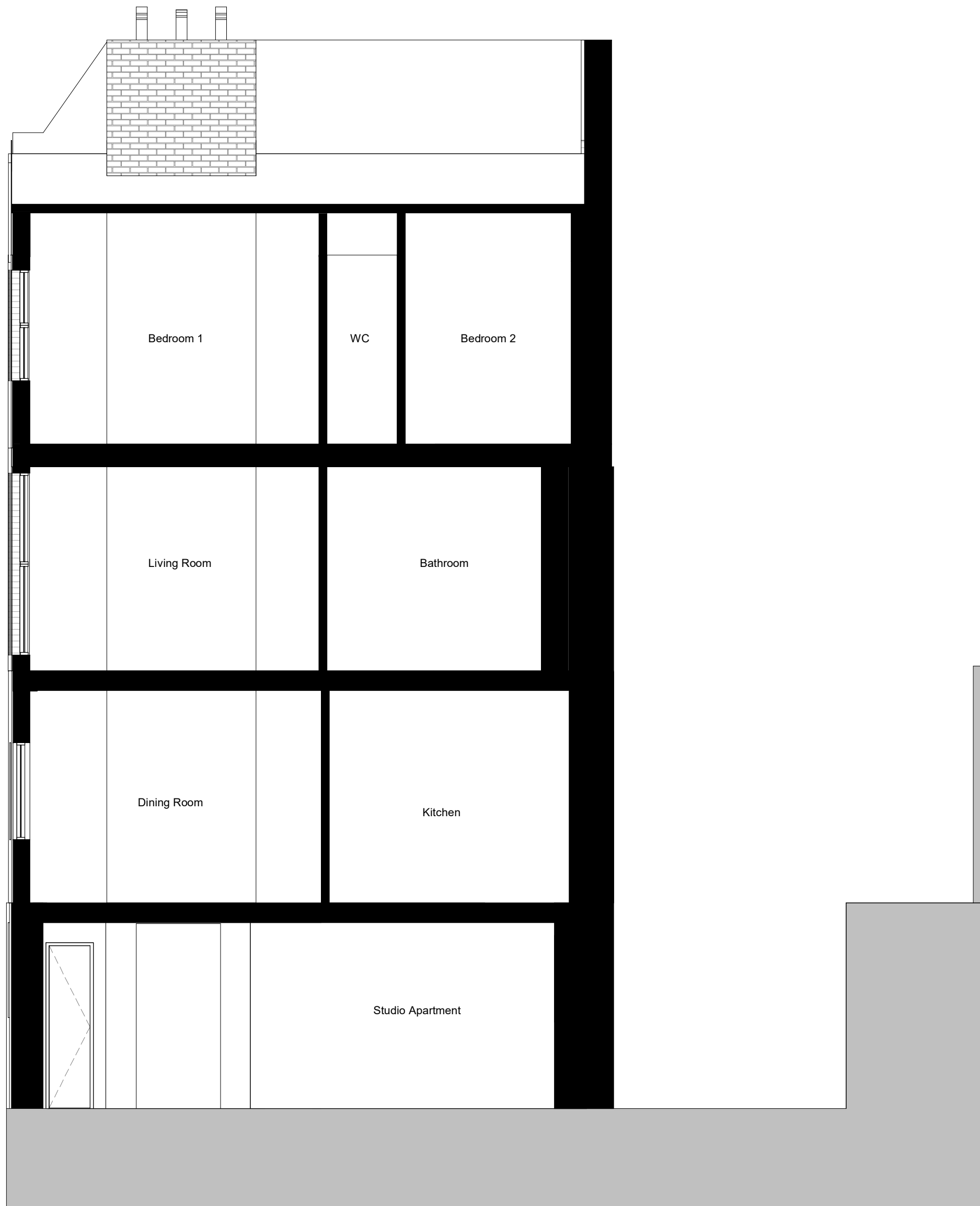
Section AA Existing 1:50