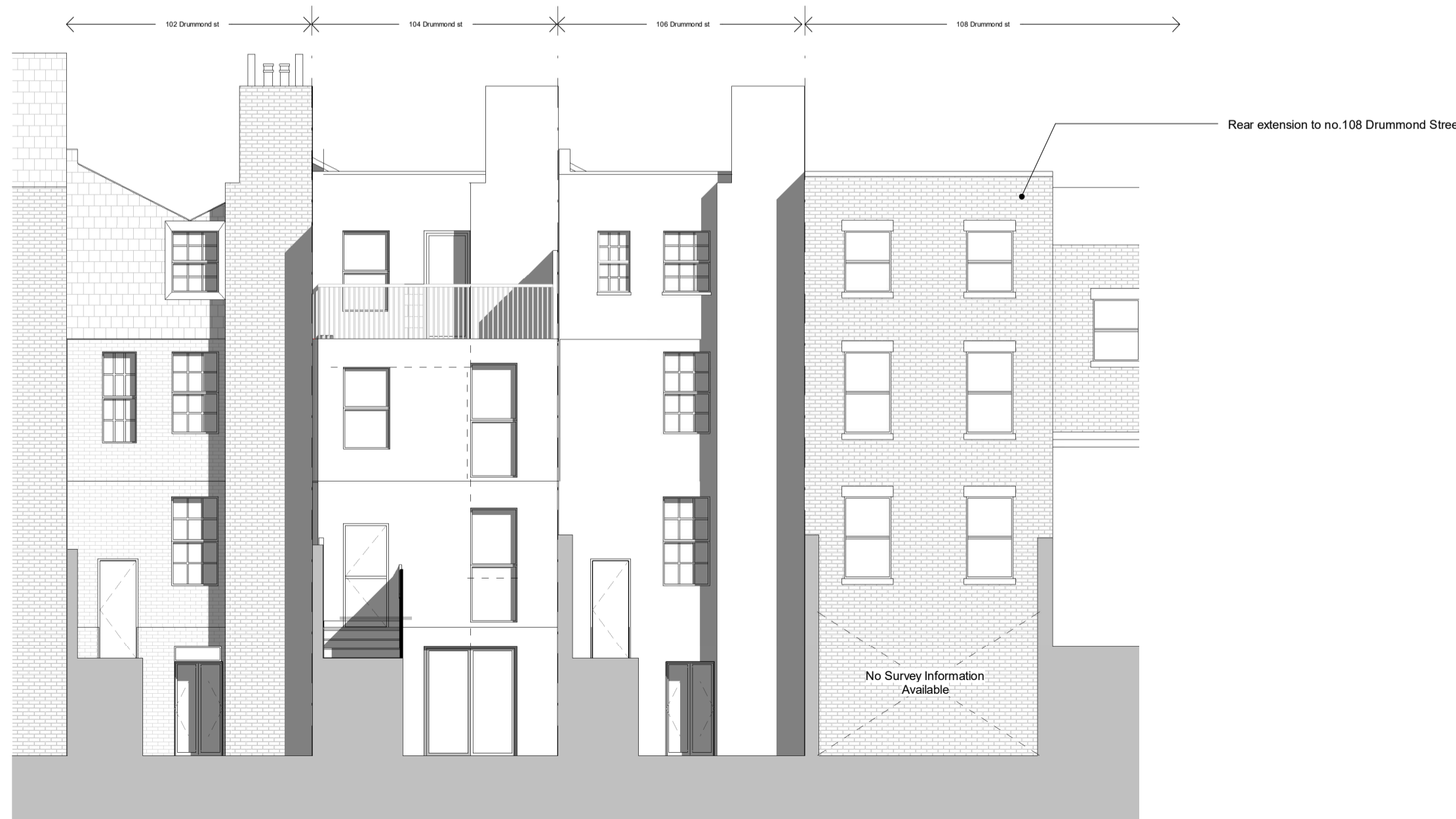
Proposed Rear Elevation Context 1:100

Drawing Notes 1. Do not scale this drawing. 2. All dimensions must be checked on site and any discrepancies verified with the architect. 3. Unless shown otherwise, all dimensions are to structural surfaces. 4. All work must comply with relevant building Standards and Building Regulations requirements. Drawing errors and omissions to be reported to the architect. THIS IS NOT A CONSTRUCTION DRAWING, IT IS UNSUITABLE FOR THE PURPOSE OF CONSTRUCTION AND MUST ON NO ACCOUNT BE USED AS SUCH.