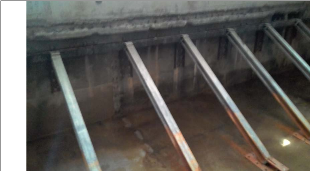
View of lower basement from upper basement showing standing water, previous water marks and temporary propping to wall along Tottenham Street