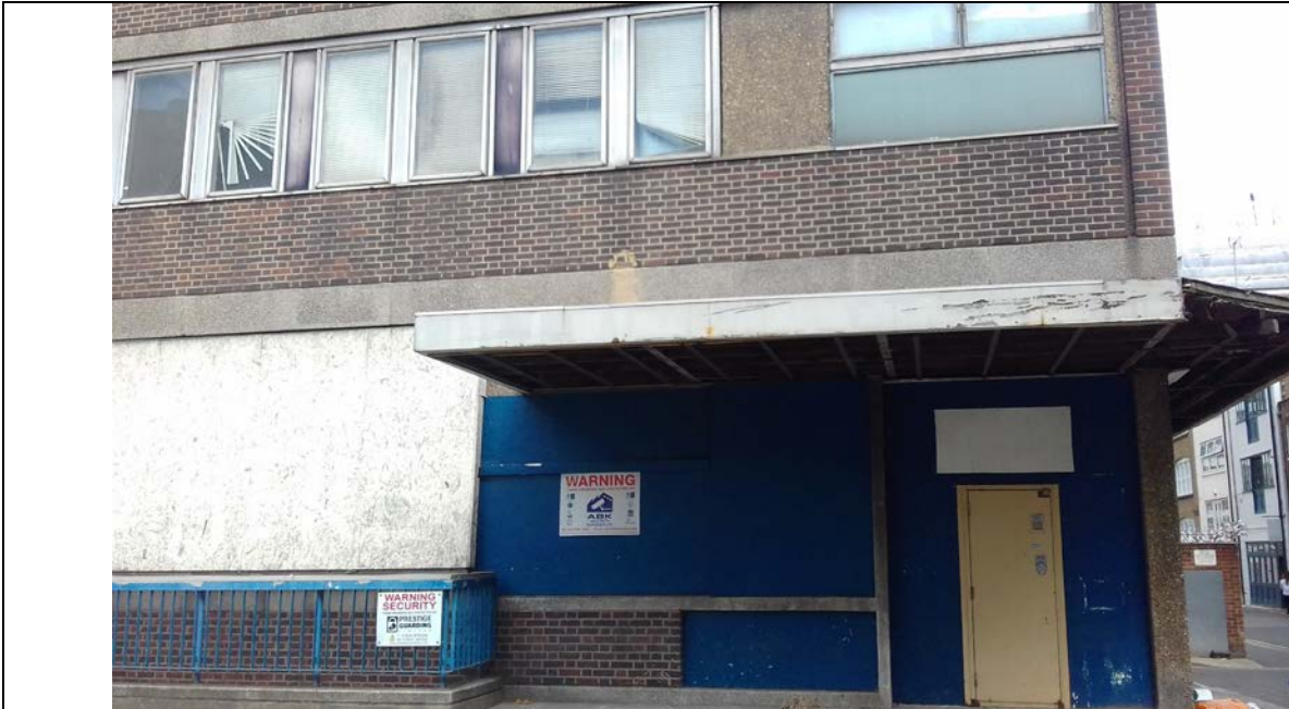
Entrance to Arthur Stanley House looking west from Tottenham Street