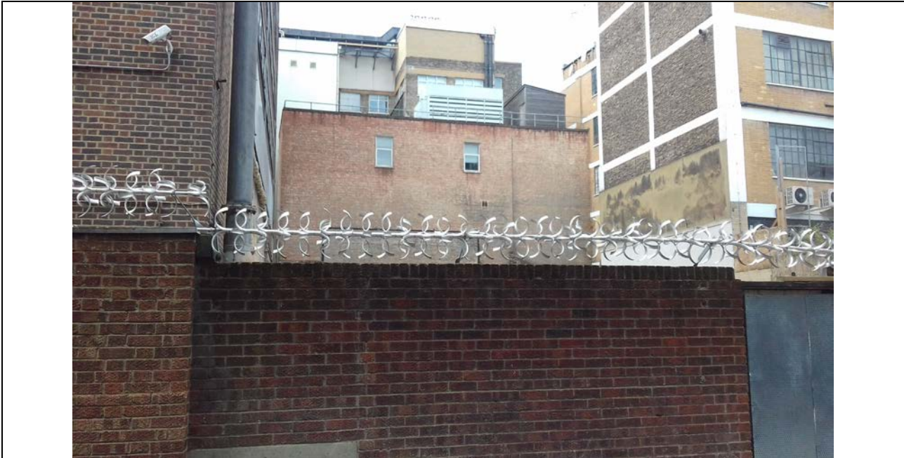
View of rear party wall properties from Tottenham Mews looking north east