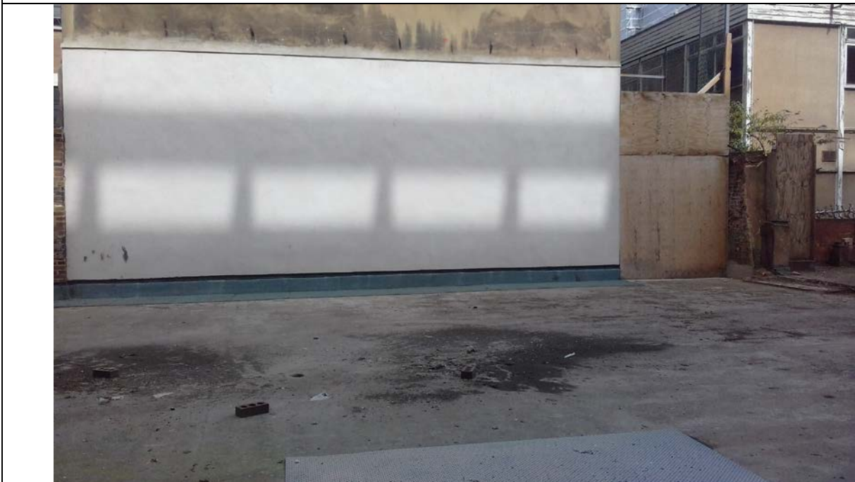
View of existing courtyard from ground level looking north west