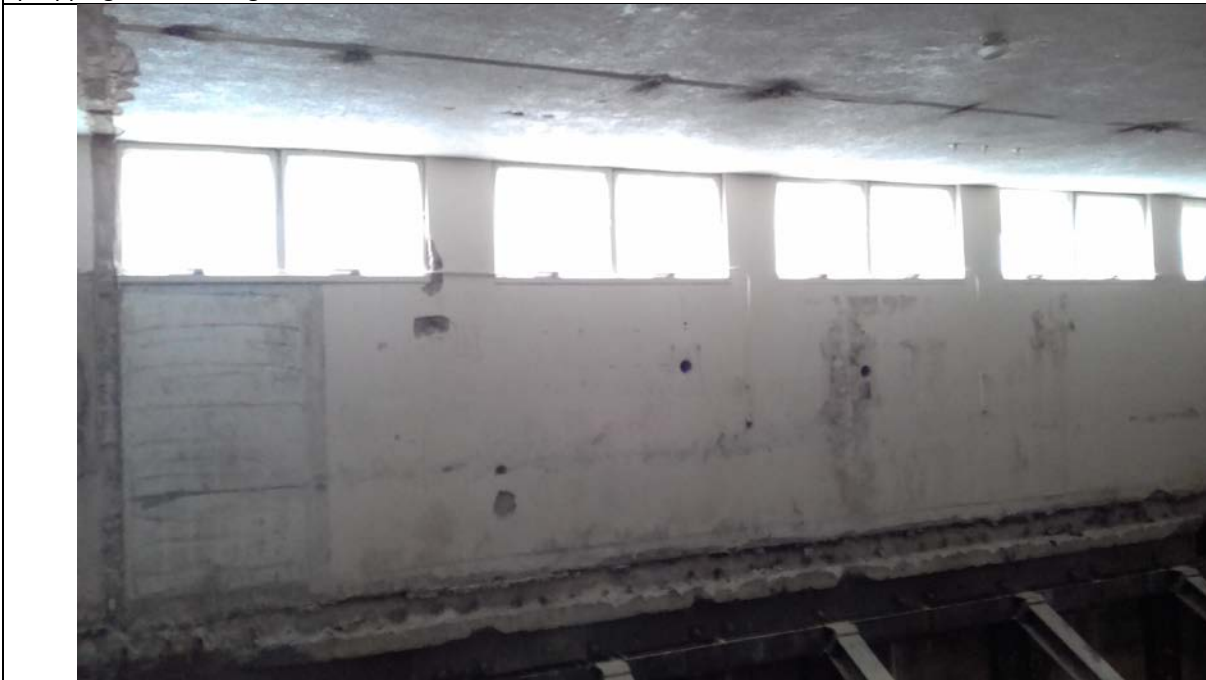
View of lightwell along Tottenham Street from upper basement