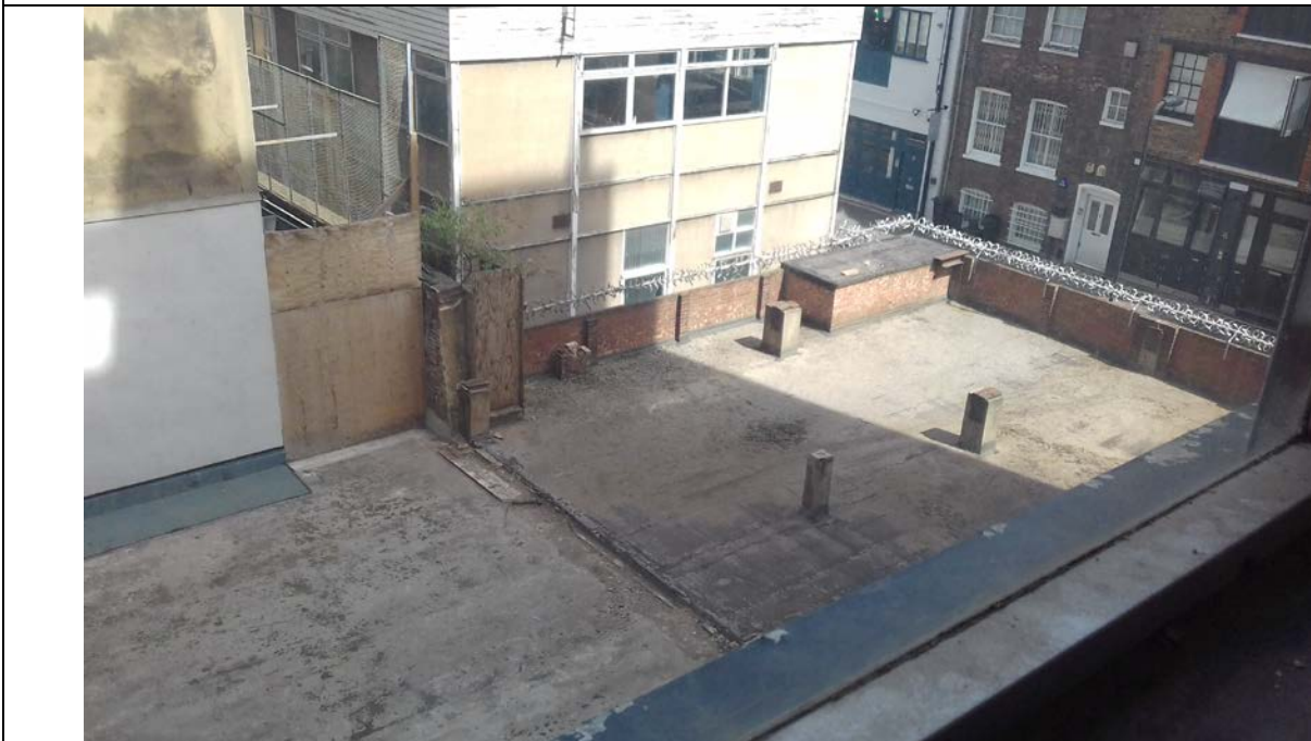
View of existing courtyard looking north from first floor of Arthur Stanley House