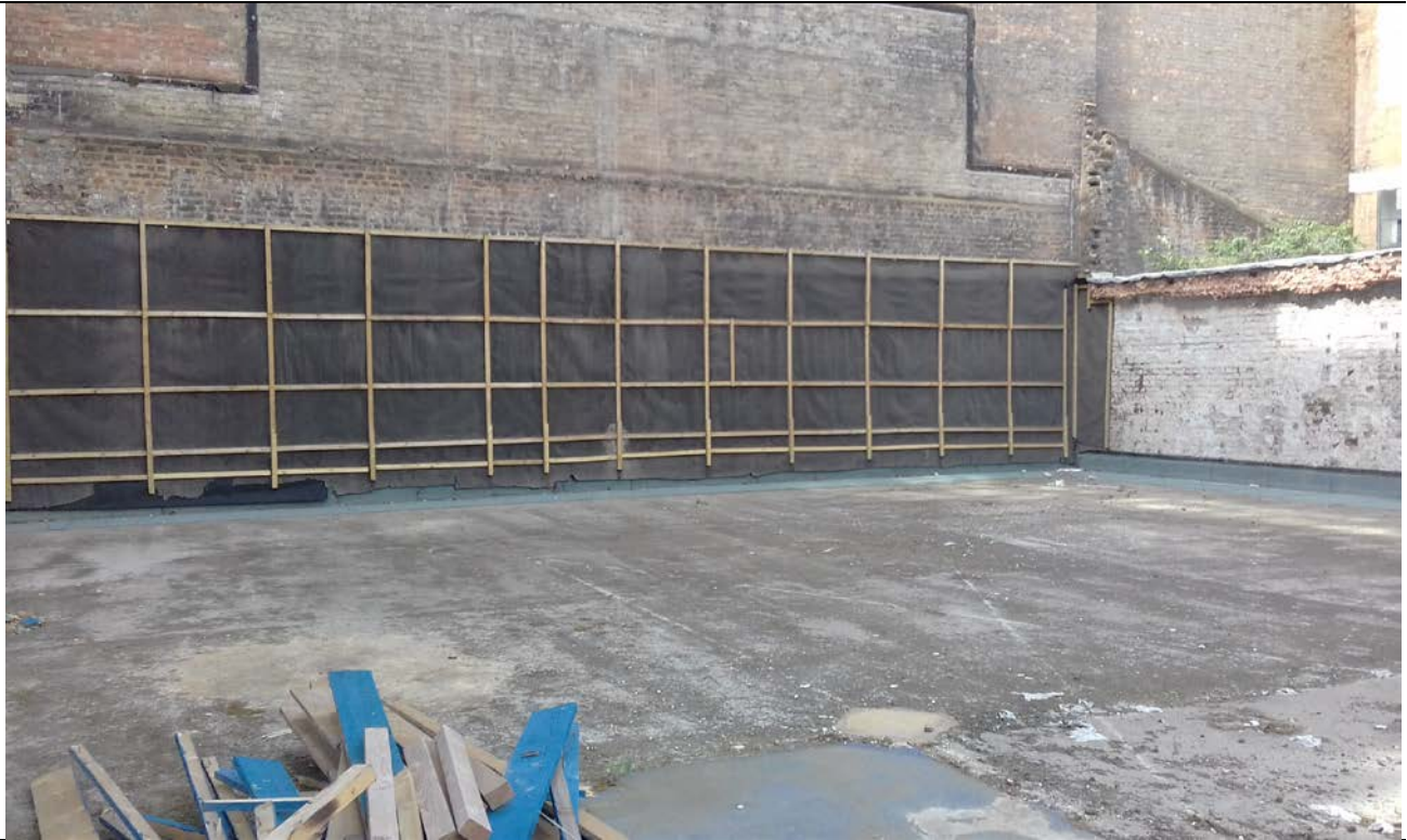
View of existing courtyard from ground level looking west