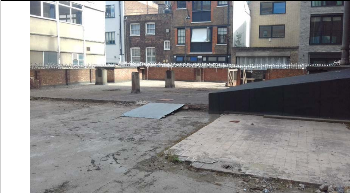
View of existing courtyard from ground level looking north