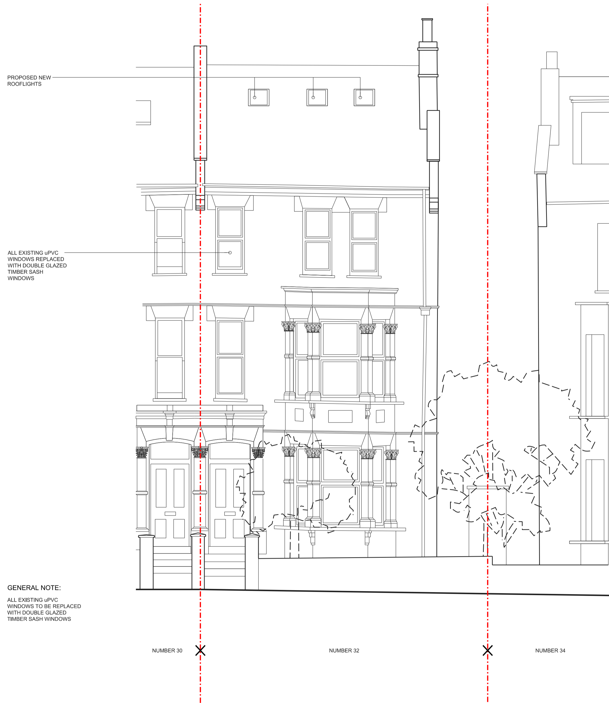
01 PROPOSED SOUTH ELEVATION 1:50@A1