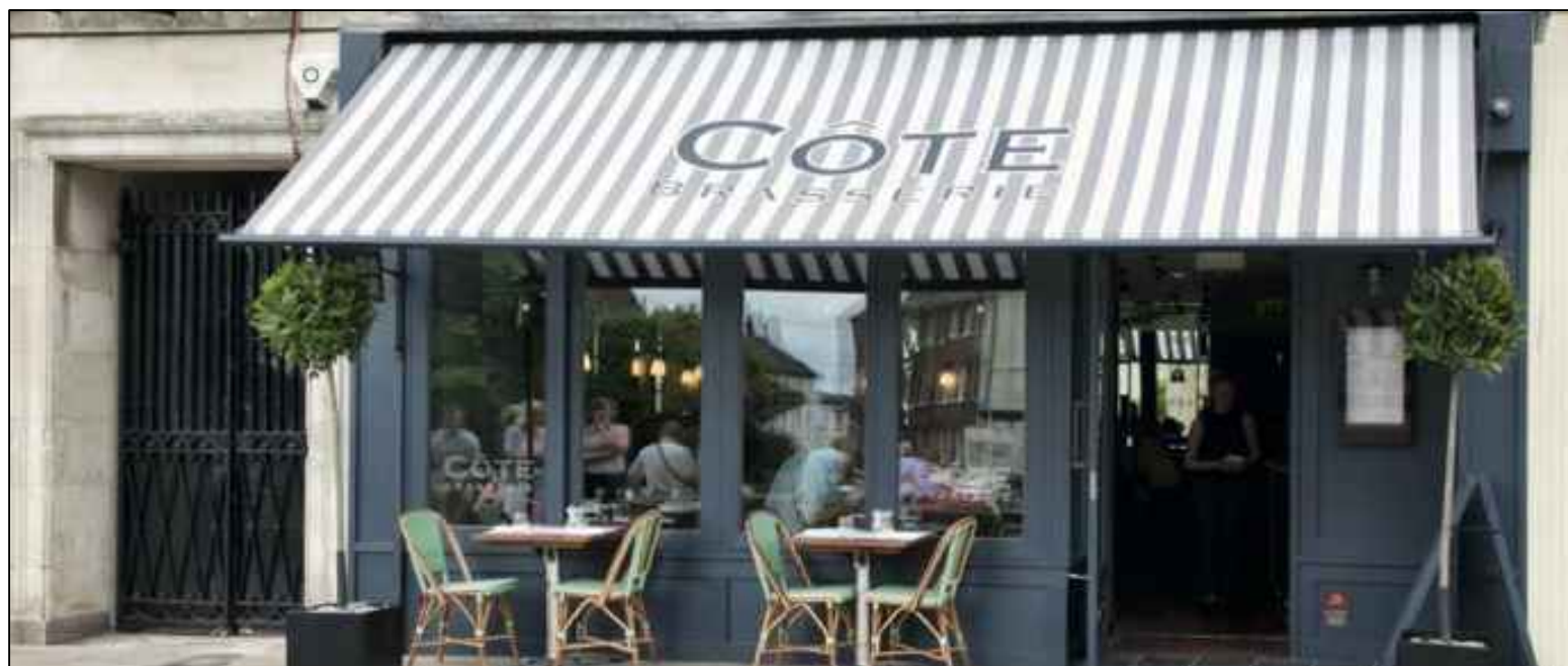
B TYPICAL IMAGES OF EXTERIOR FURNITURE ARRANGEMENT

RED LINE INDICATED BOUNDARY OF EXTERIOR TABLES AND CHAIRS