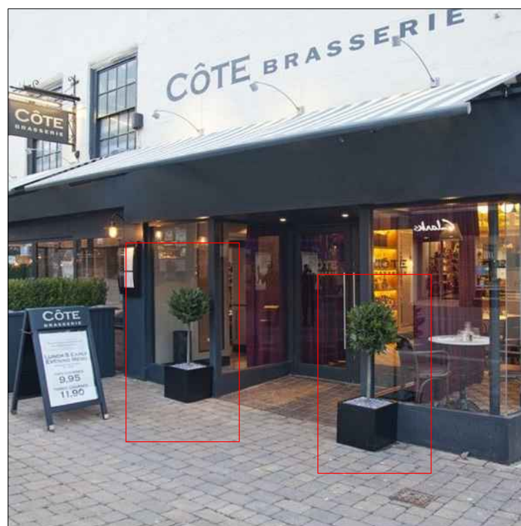
B 2x BAY TREE INSPIRATION