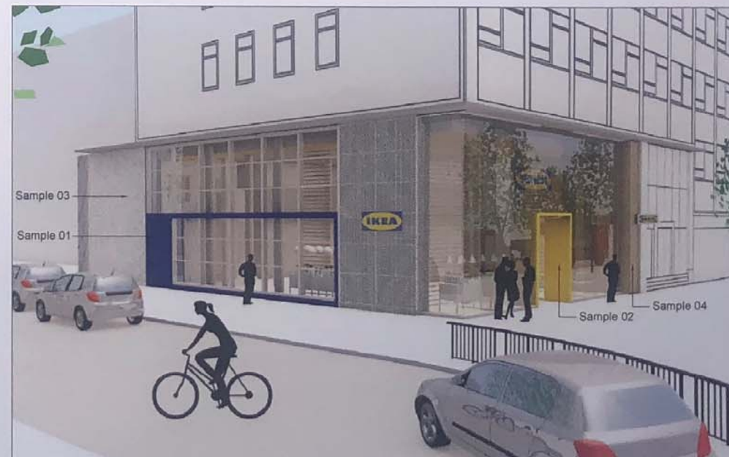
05 Proposed Visual

revision P01 rev JP created SM date 12/09/2018 initial issue