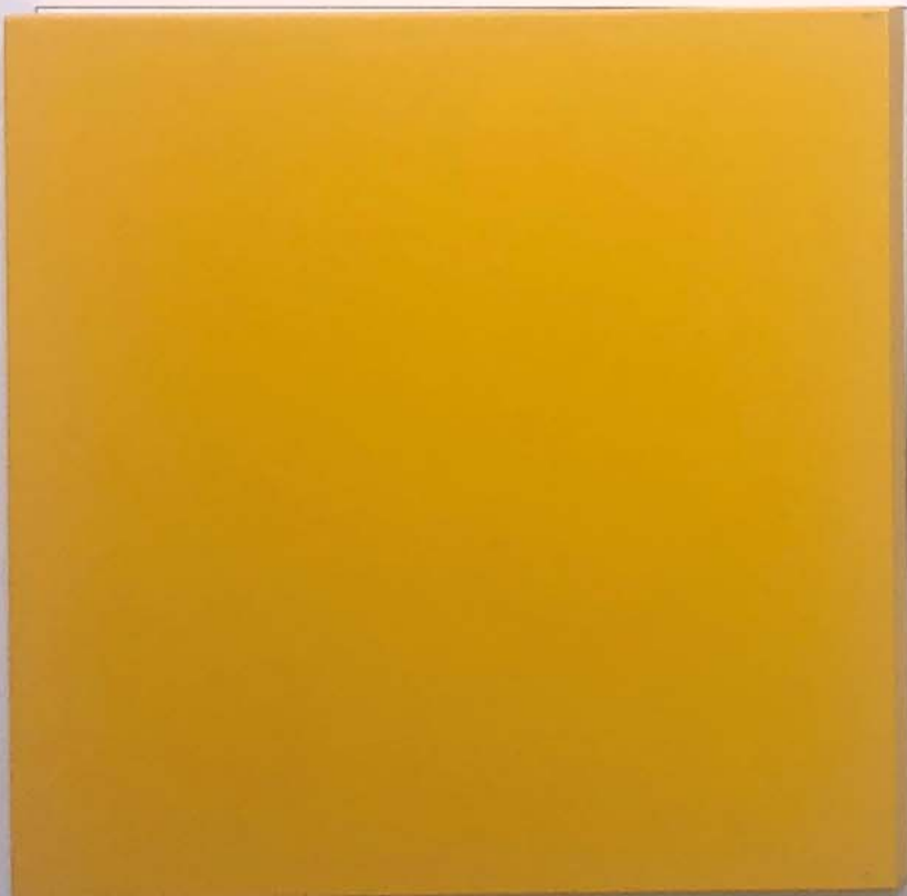
02 IKEA Yellow (NCS S 1070 - Y10R) Entrance Feature