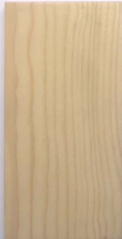
04 Larch Timber Cladding