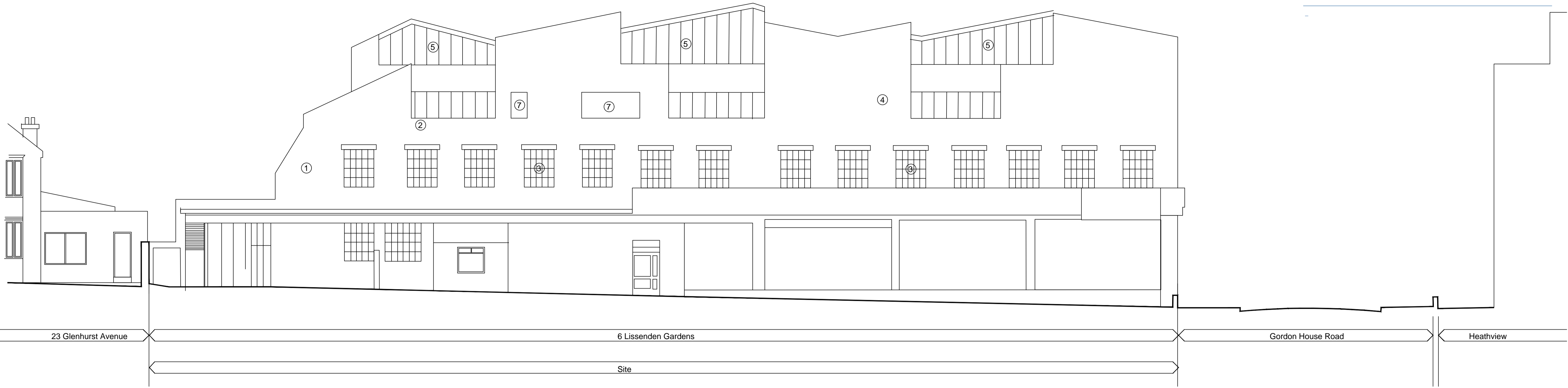
West Elevation Scale 1/100