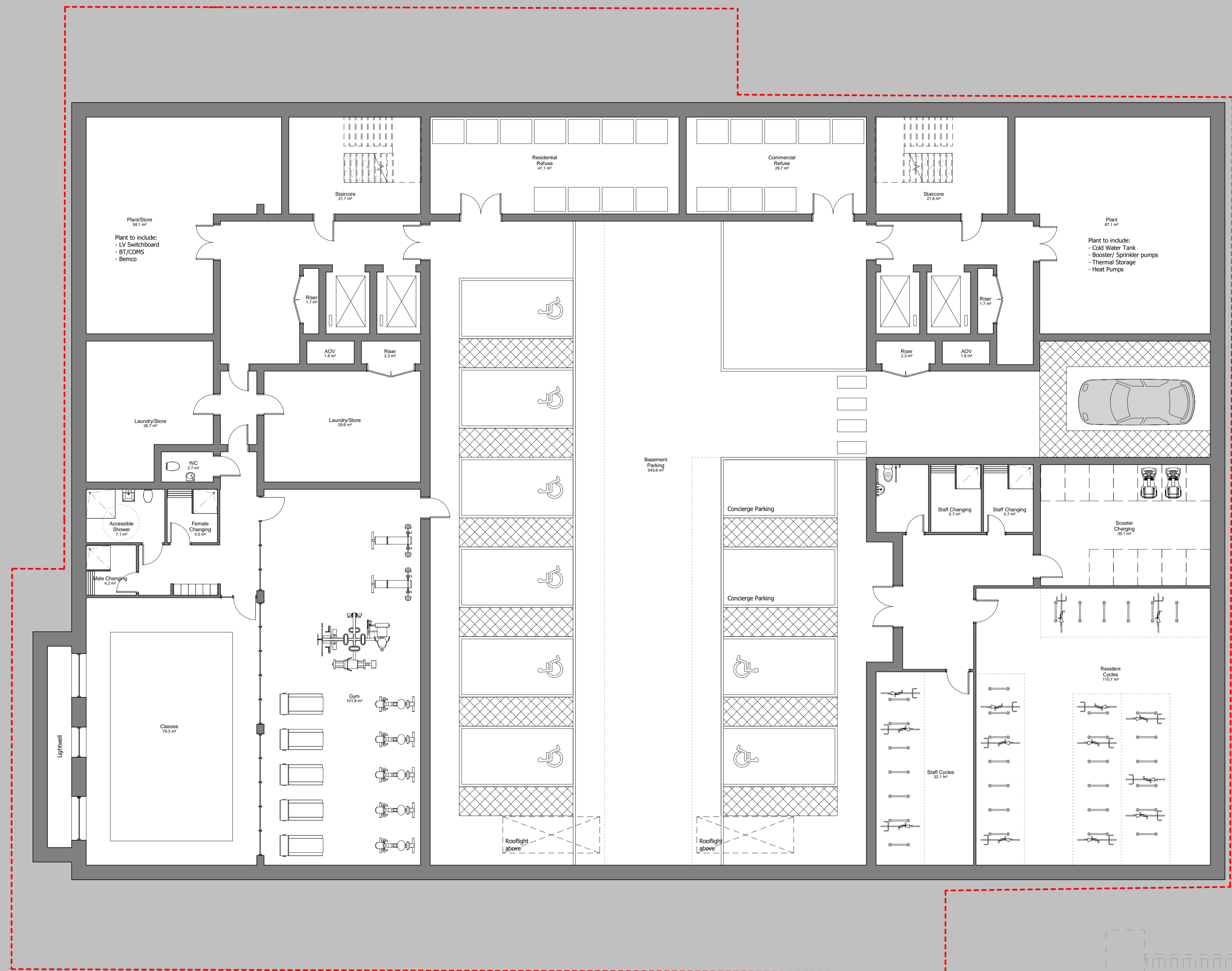
Basement Floor Plan 1:100