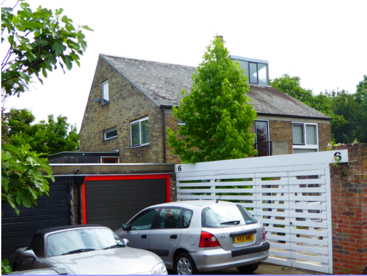
A - ASBESTOS ROOF TILES TO BE REMOVED AND REPLACED