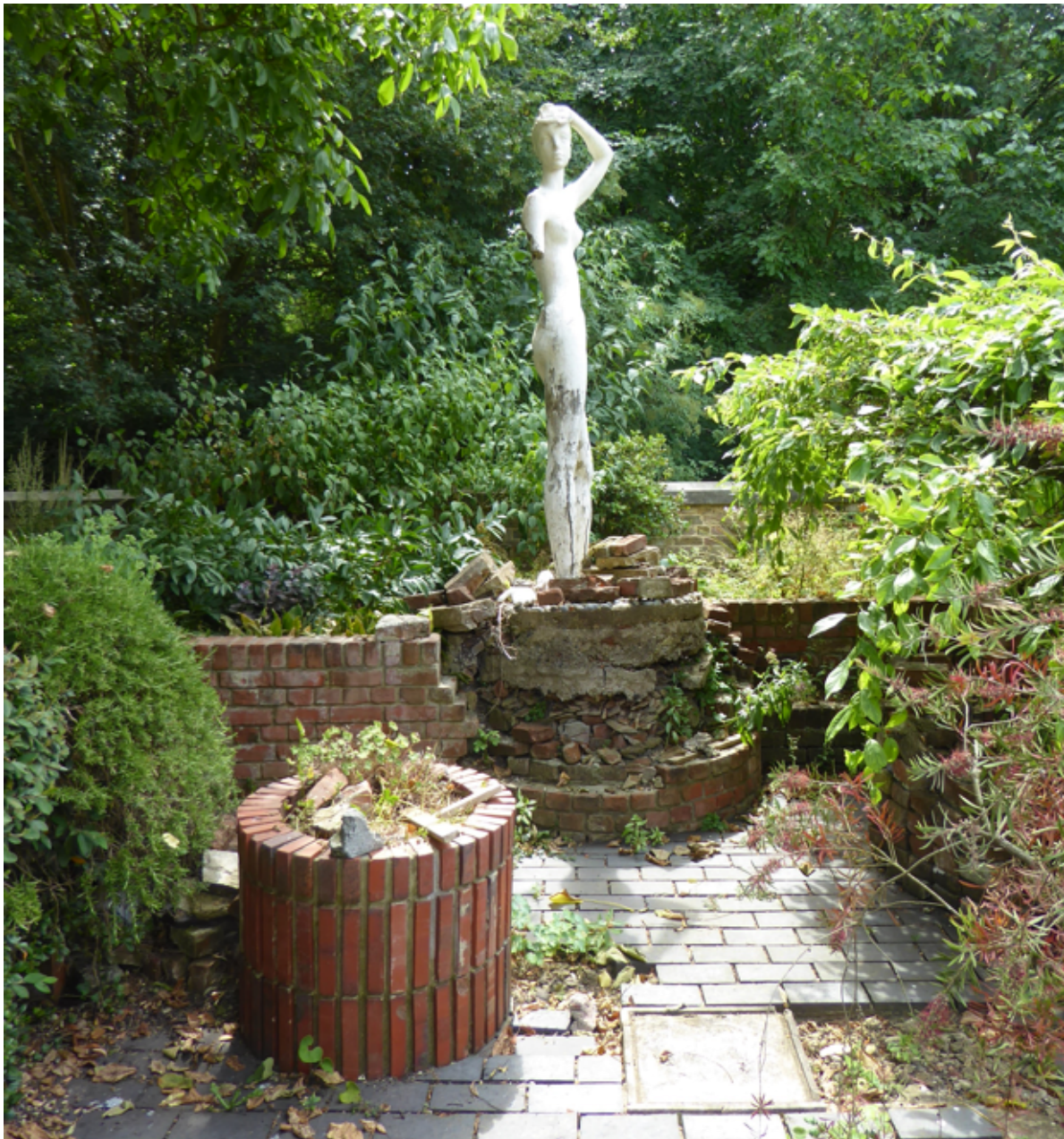
D - LISTED SCULPTURE AND PLINTH TO BE REPAIRED