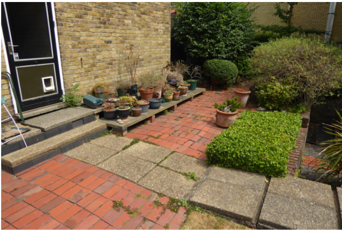
C - BRICK PAVERS TO BE RELAID FLAT ON NEW SUBSTRATE