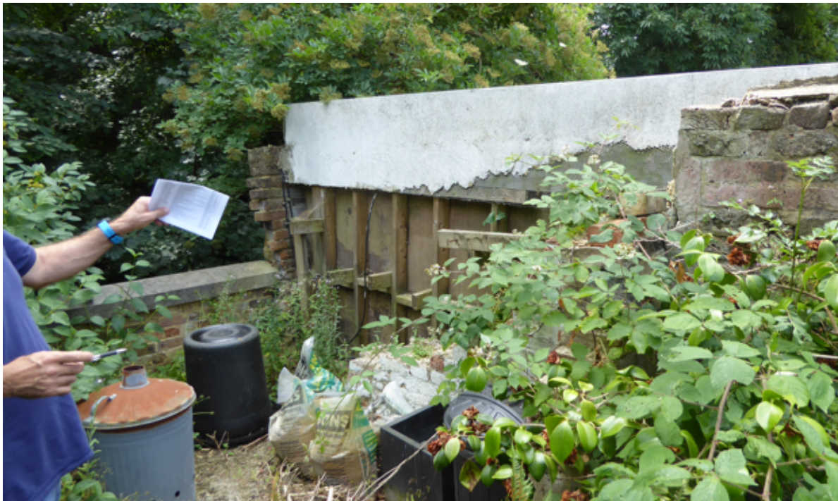
B - GARDEN BRICK WALL TO SOUTH WEST BOUNDARY MADE GOOD