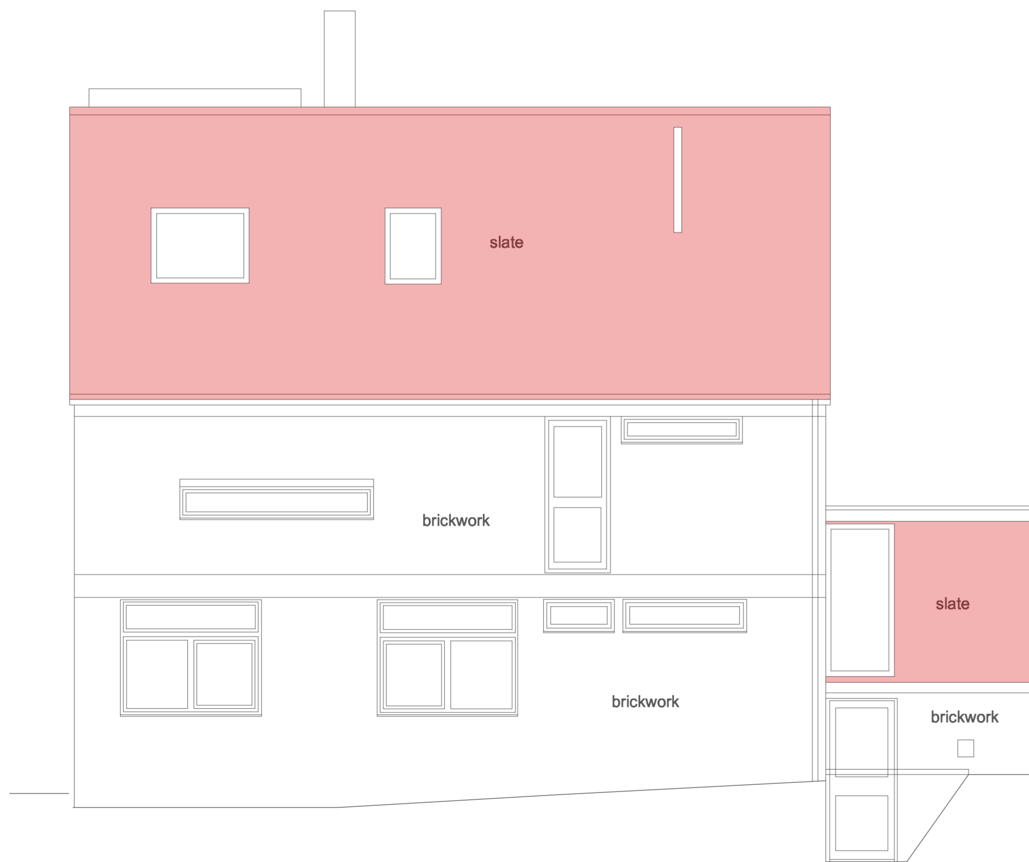
02 EXISTING NORTH EAST ELEVATION SCALE 1:50