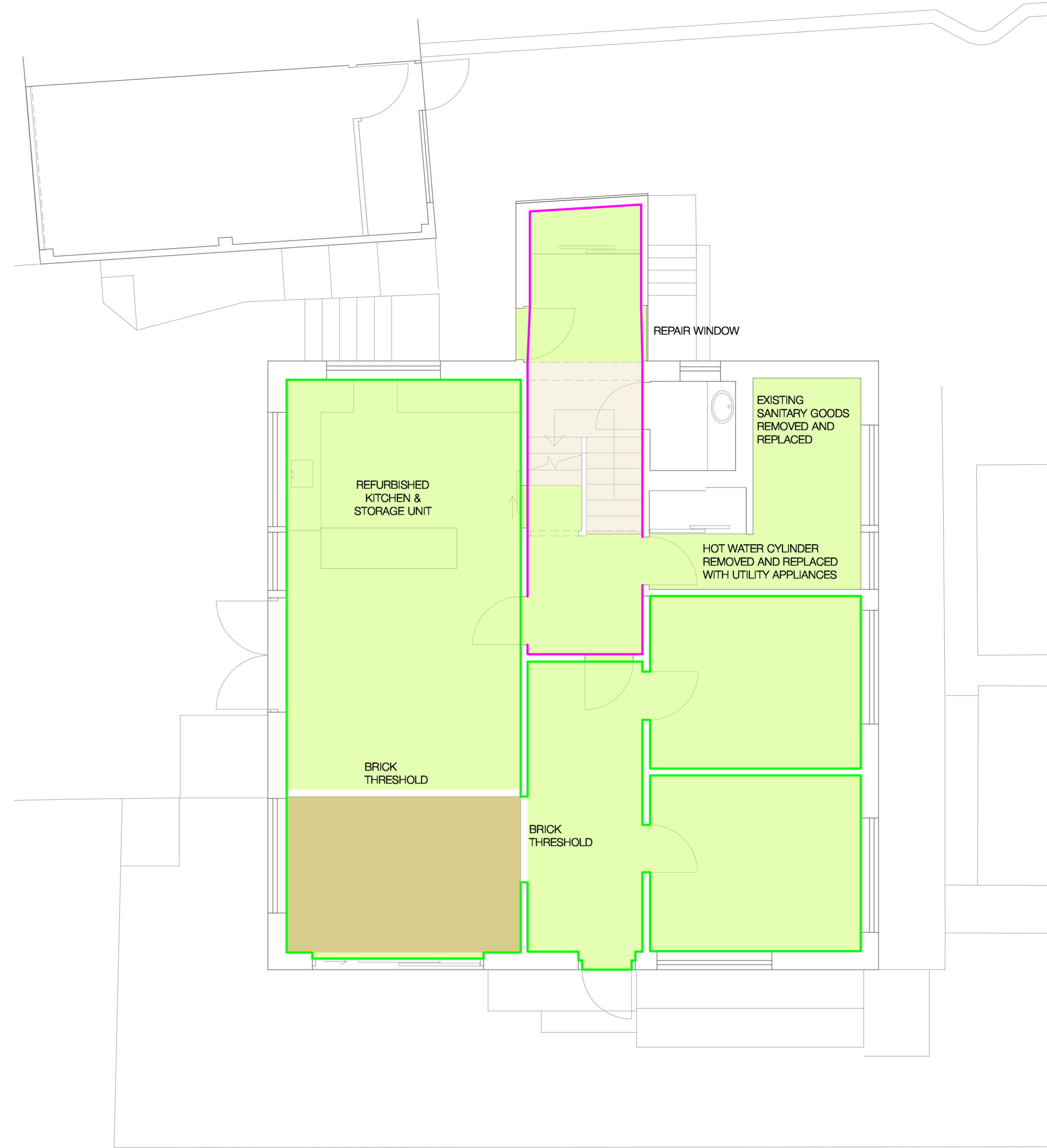
02 PROPOSED GROUND FLOOR PLAN SCALE 1:50