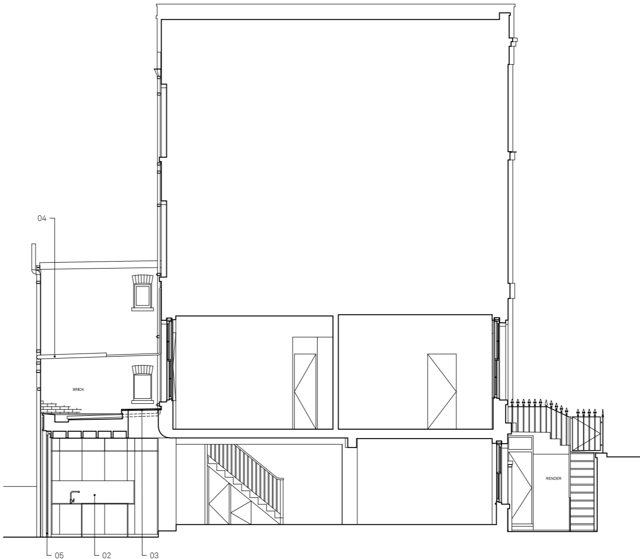
PROPOSED SECTION A-A