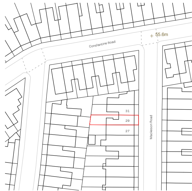
1 Location Plan 1 : 1250

General Notes: 1. Do Not Scale This Drawing 2. All dimensions are in millimetres unless otherwise stated 3. Drawing based on survey information by others 4. Contractors are not to scale dimensions from this drawing 5. Contractors are to check all dimensions prior to commencement on site and notify the architect of any errors, omissions, or discrepancies 6. West Port Five Limited retain copyright of this drawing. It may not be copied, altered or reproduced in any way without their written authority.