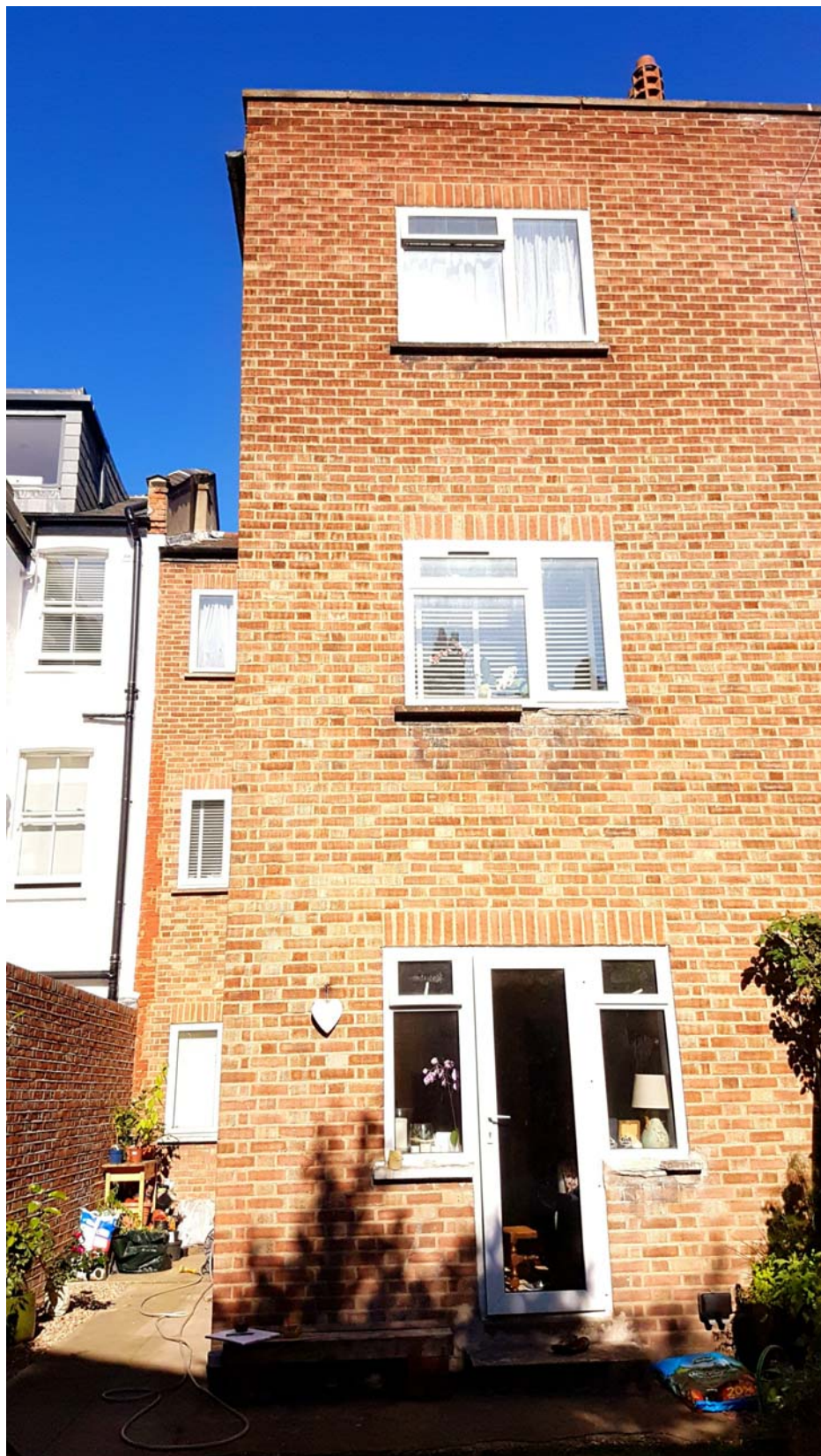
29A Mackeson Road - Rear elevation