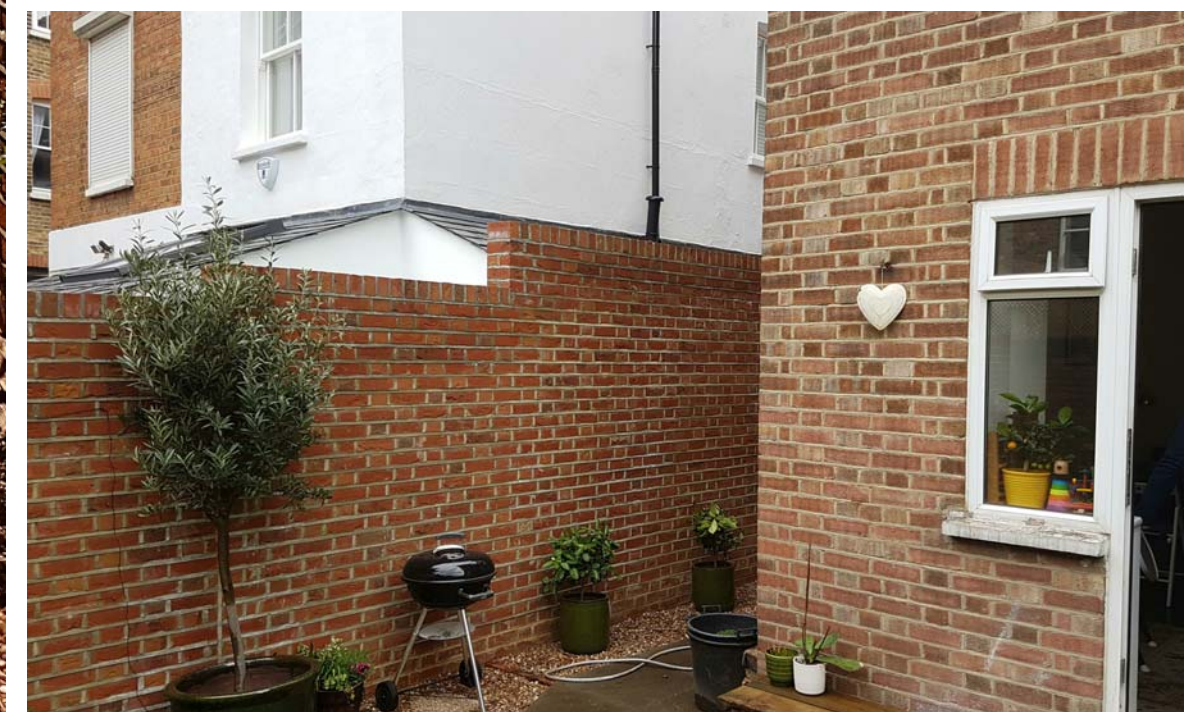
29A Mackeson Road - Boundary with no. 31 and existing 215mm brick Party Wall

General Notes: 1. Do Not Scale This Drawing 2. All dimensions are in millimetres unless otherwise stated 3. Drawing based on survey information by others 4. Contractors are not to scale dimensions from this drawing 5. Contractors are to check all dimensions prior to commencement on site and notify the architect of any errors, omissions, or discrepancies 6. West Port Five Limited retain copyright of this drawing. It may not be copied, altered or reproduced in any way without their written authority.