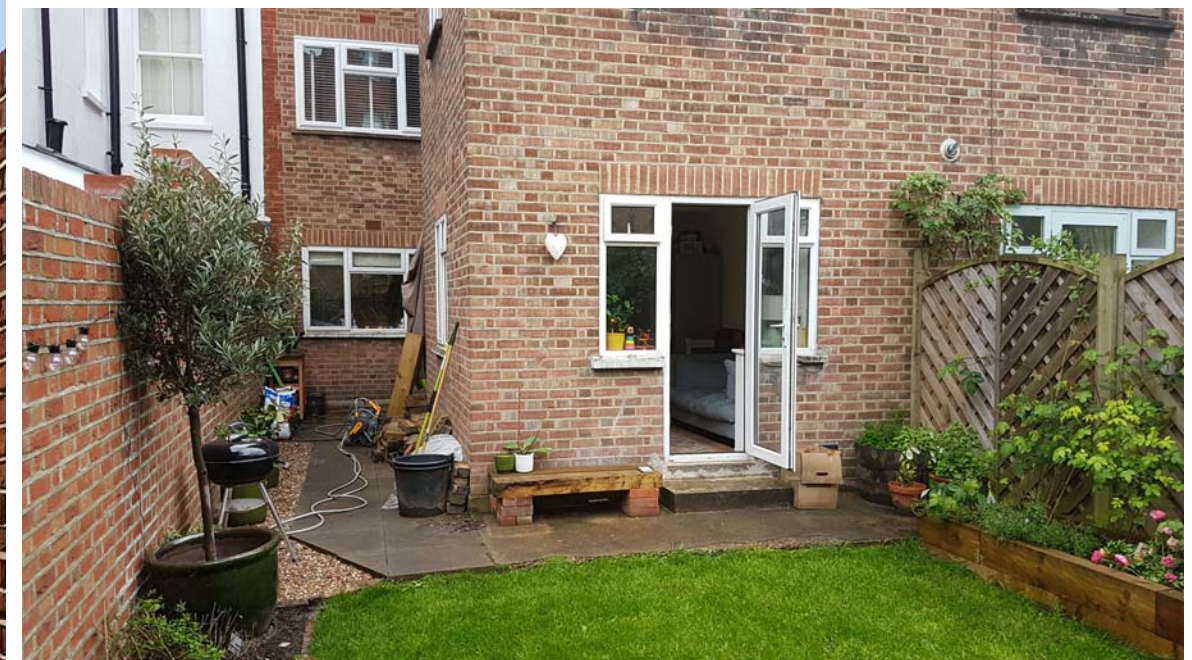
29A Mackeson Road - Existing Garden