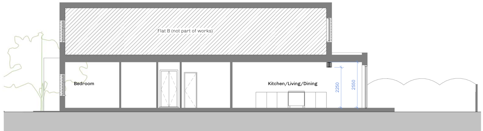
3 Proposed Long Section 1 : 100