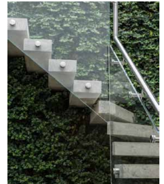
CANTILEVERED STAIR PRECEDENT