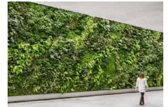
LIVING WALL PRECEDENT