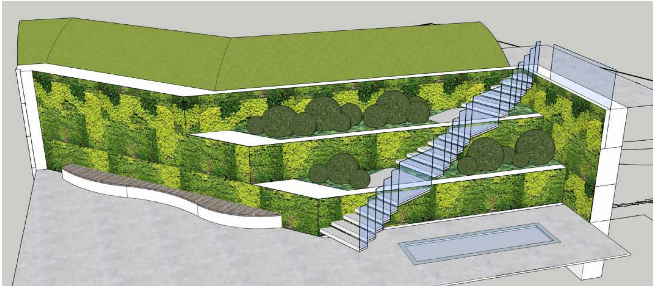
PROPOSED RETAINING WALL TERRACES

RETAINING WALL = 2 TERRACES / CANTILEVERED CONCRETE STAIRS