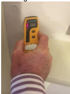
Moisture meter readings suggesting rising dampness

In addition to the rising dampness we noted other defects which contribute dampness within the building