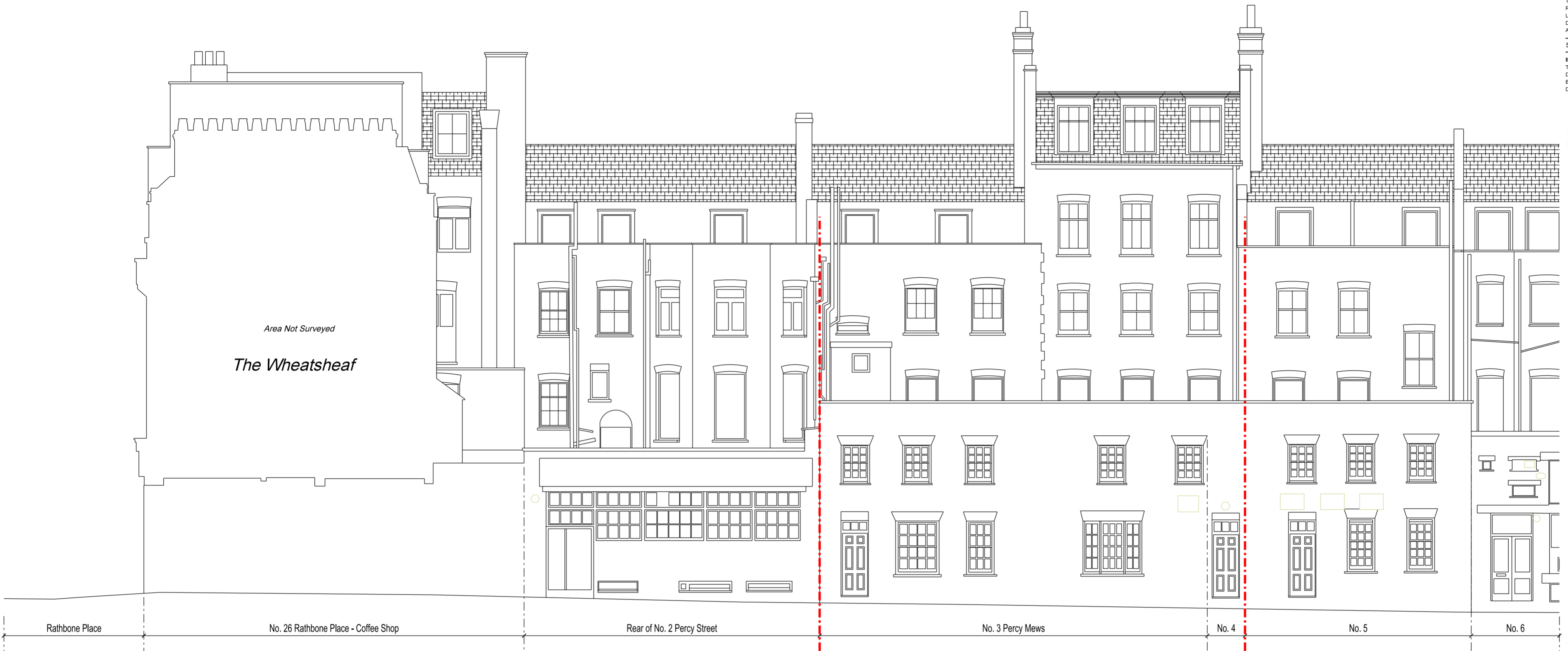
FRONT ELEVATION - South Side