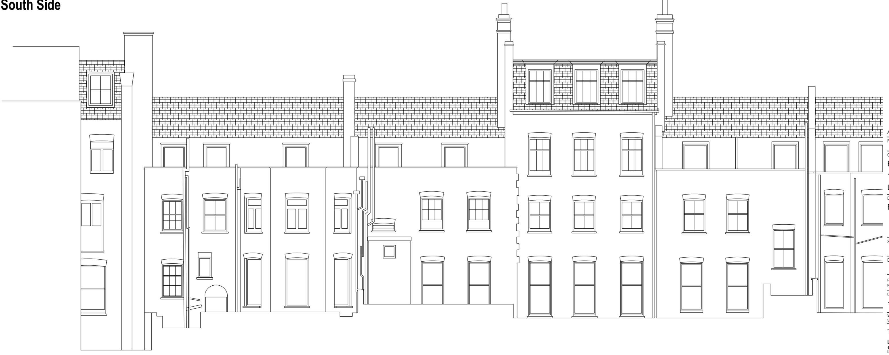
FRONT ELEVATION - South Side (High Level) Rear of Percy Street