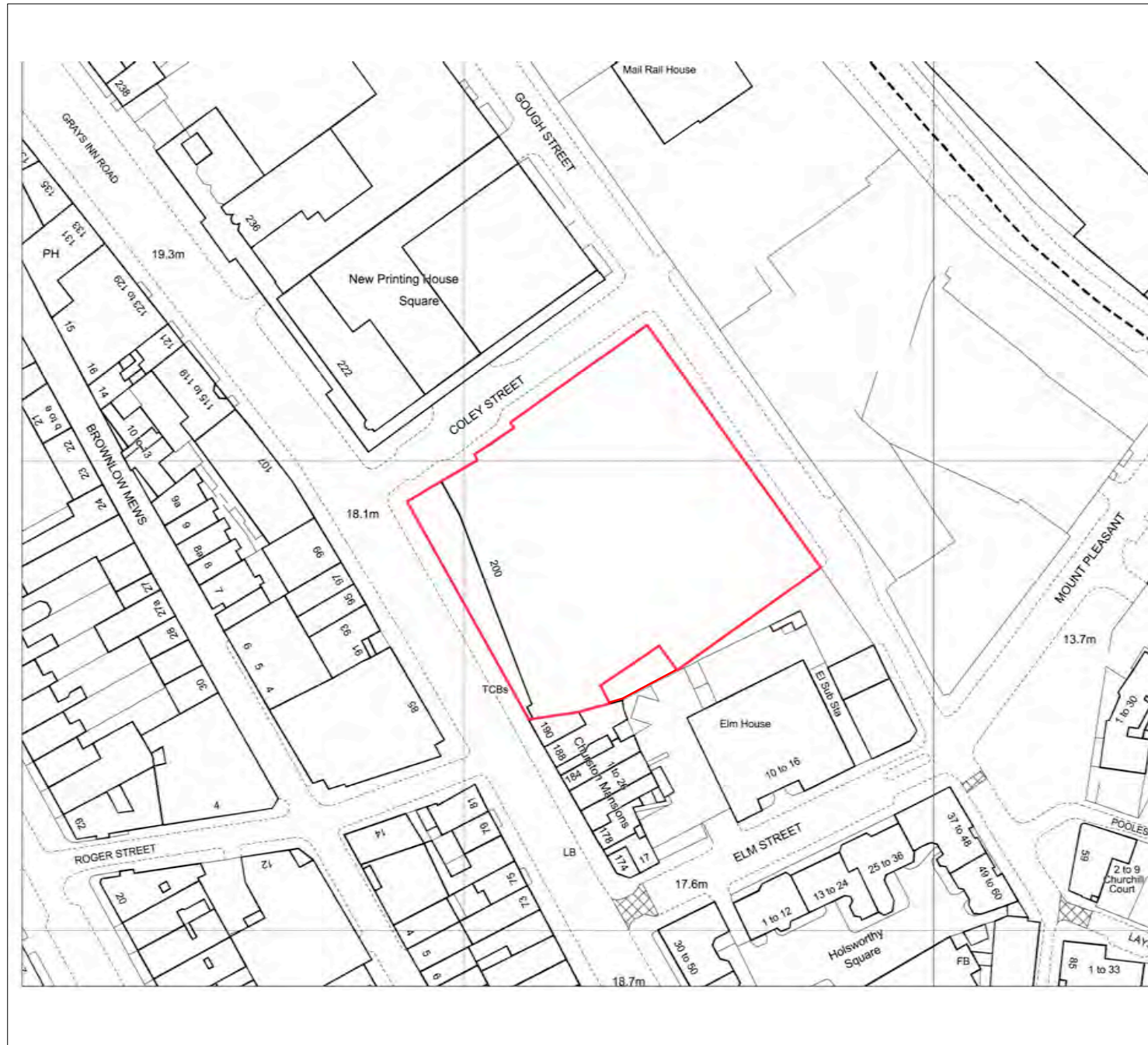
01 200 Gray's Inn Road: Site Plan