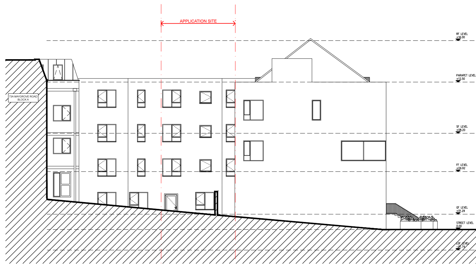
2 EXISTING WEST ELEVATION B3(20)E00 SCALE: 1:200 (A3)